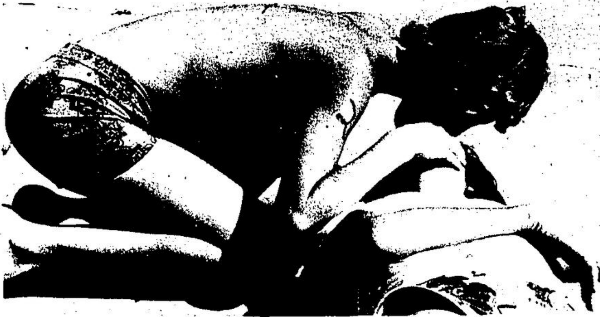
IT IS NOT the scene of an averted tragedy, it is a demonstration of mouth to mouth breathing by Tom