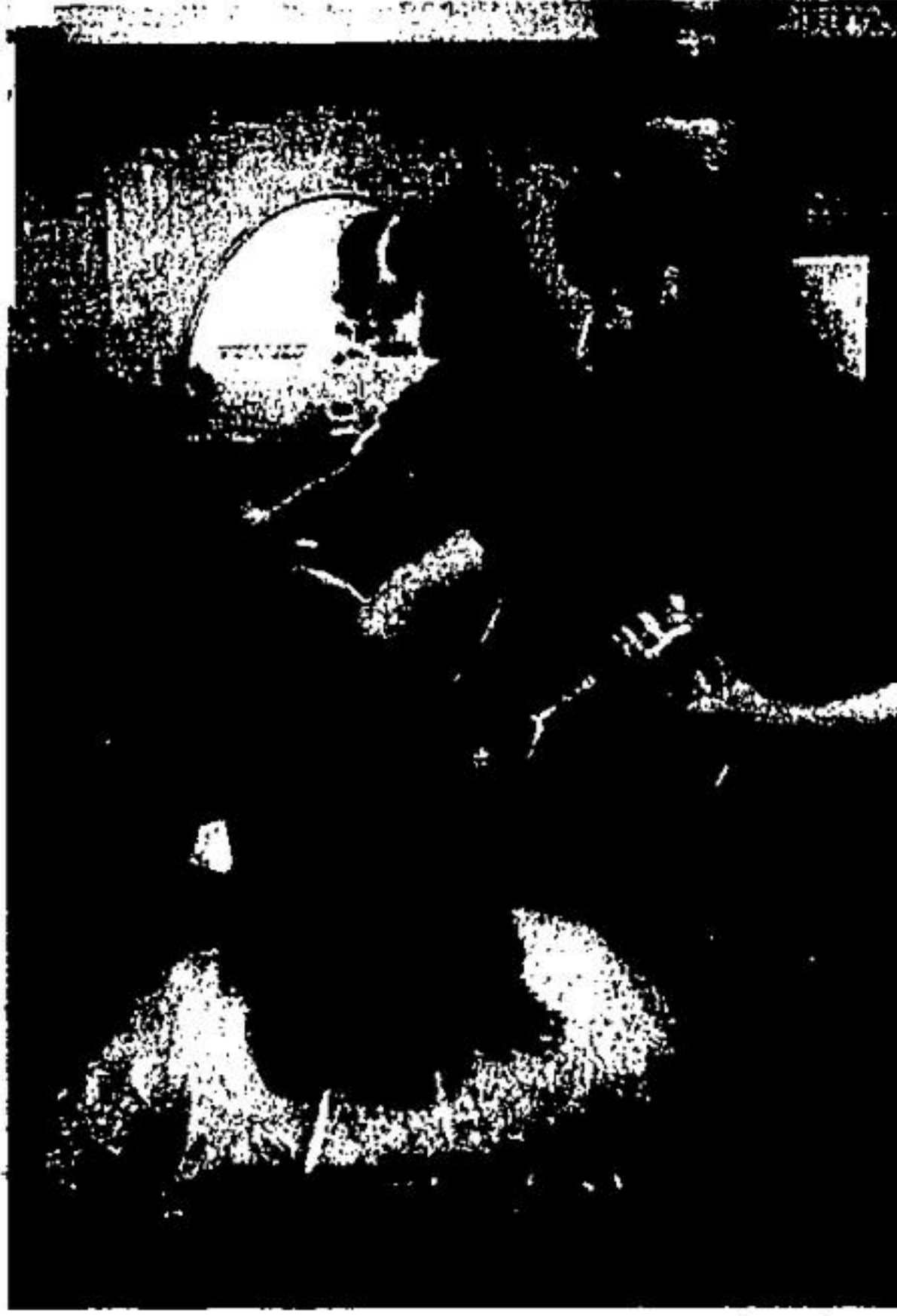
Free beauty care was one of seven draw prizes offered during General Wolfe's Open House. As well, during the evening event, there was