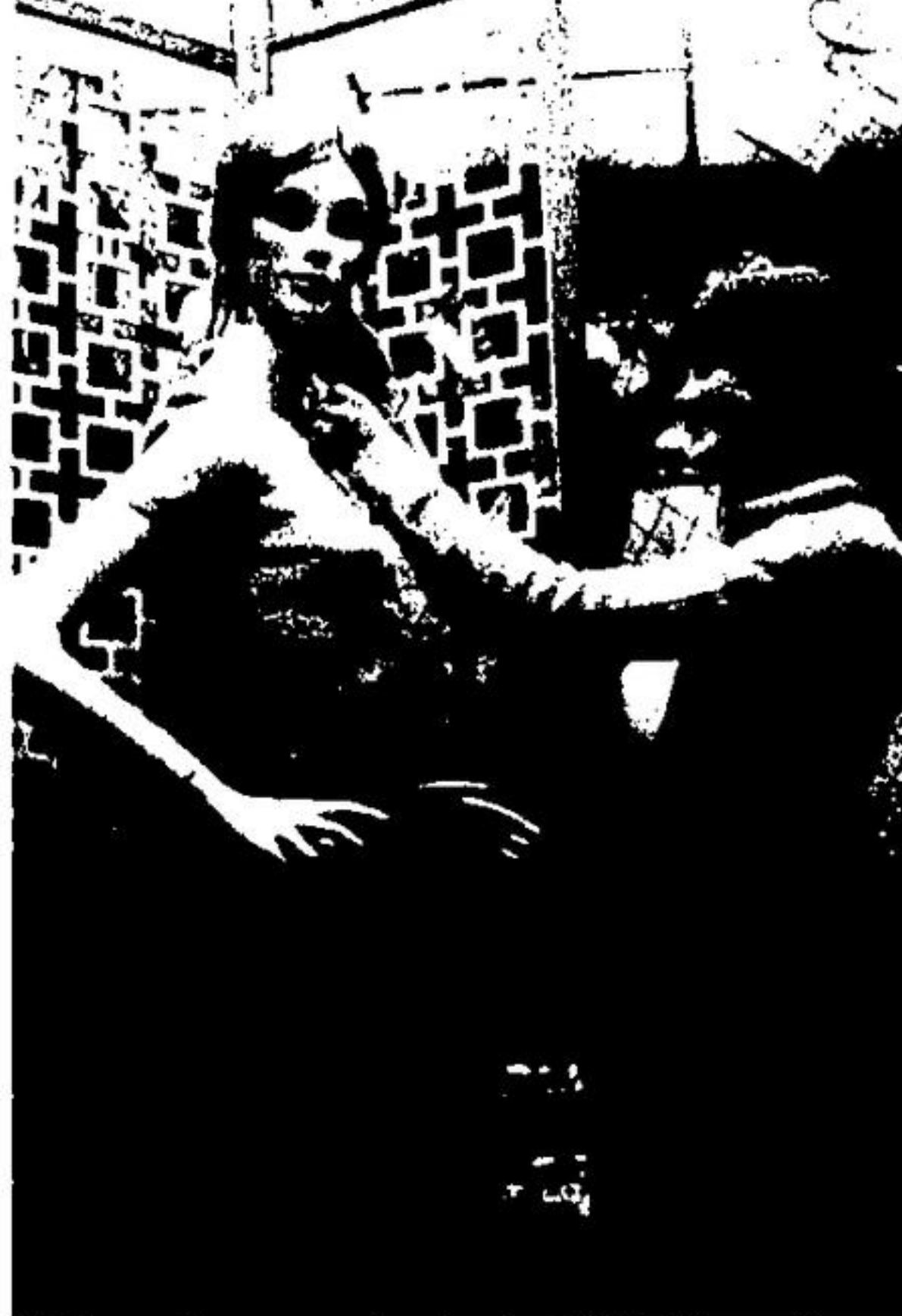
Peacock Boutique, one of two school stores operated by Merchandising students, was open offering up to date