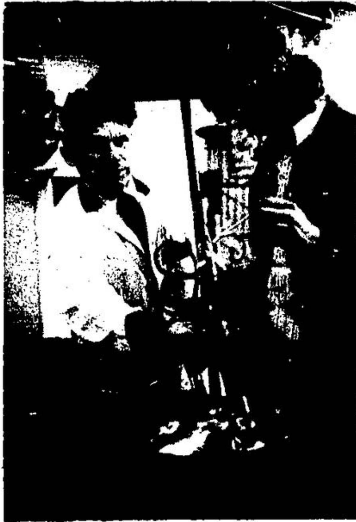
Wrought iron work from Metal Fabrication Services was one of seven draw prizes offered during General Wolfe's May 16 Open House.