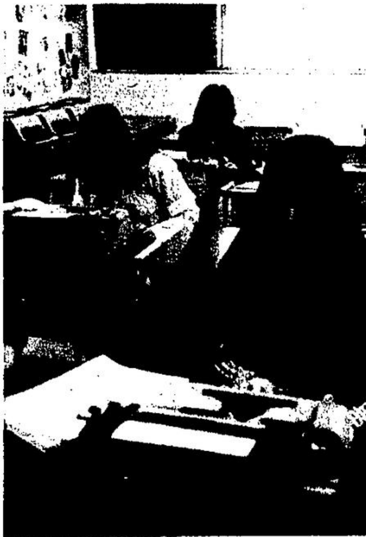
General Wolfe's Commercial Services provided demonstrations of EDL and Dlatype office typing procedures in Room 141, during General Wolfe's Open House and Exhibition on Wednesday, May 16. A number of Georgetown and area students attend the school.