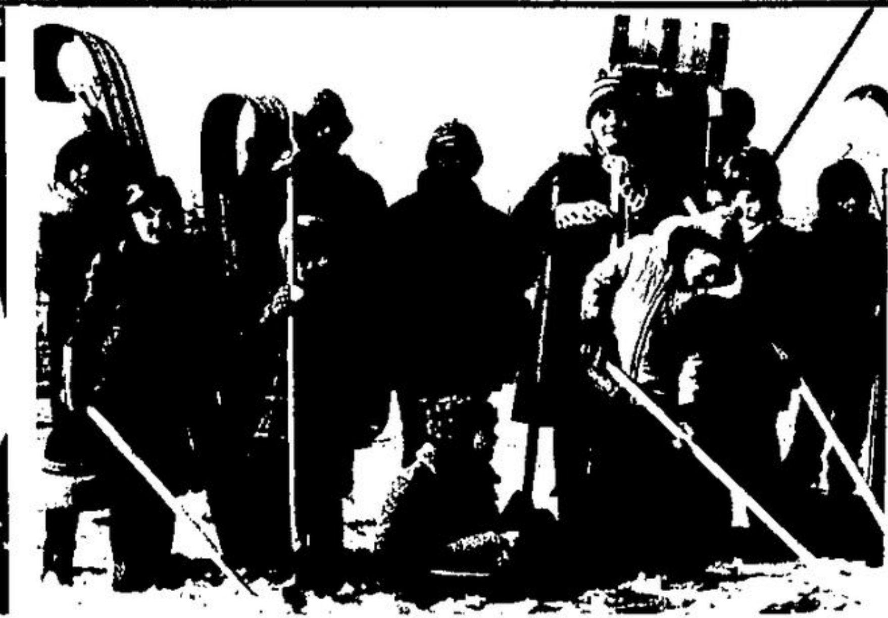
Sunshine School for mentally retarded children originated in Milton and is now located at Hornby in a building built by the North Halton Association for the Mentally Retarded.