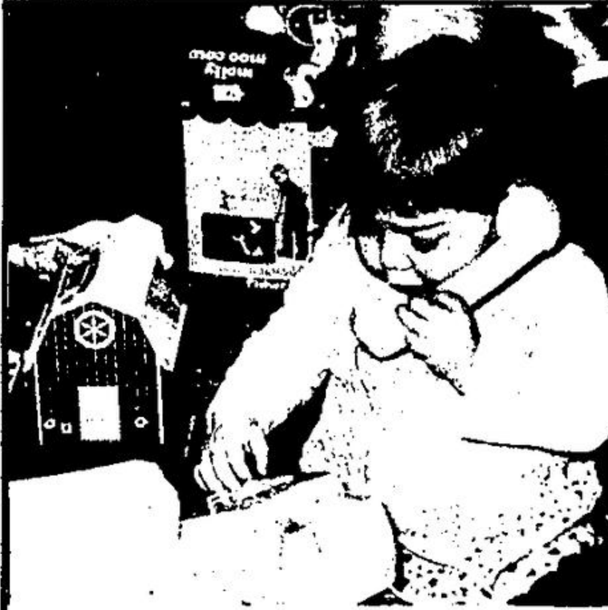
Tinkerbelle Nursery Now in operation provides Pre-School training for Retarded and other Handicapped Children.