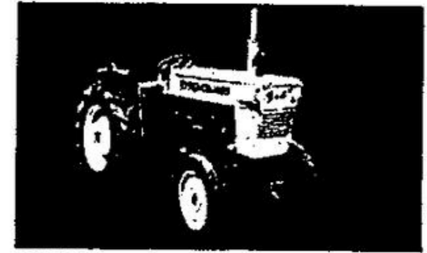
L200 (20 hp)

They're here! Rugged, versatile world famous Kubota diesels at down-to-earth prices. Perfect for mowing, tilling, hauling, snow removing, harrowing, digging, cultivating, etc. Proven for years all over the world. Three models (17, 21 & 26 hp) regular, turf and wide tread tires • low prices • low upkeep • 3-point hitch • two or four speed PTOs • hydraulic lift • 8 or 10 gear transmissions • uses Category #1 implements (we have them all!). Plenty of parts available and expert service by our specially trained men. Come in and get a free demonstration.