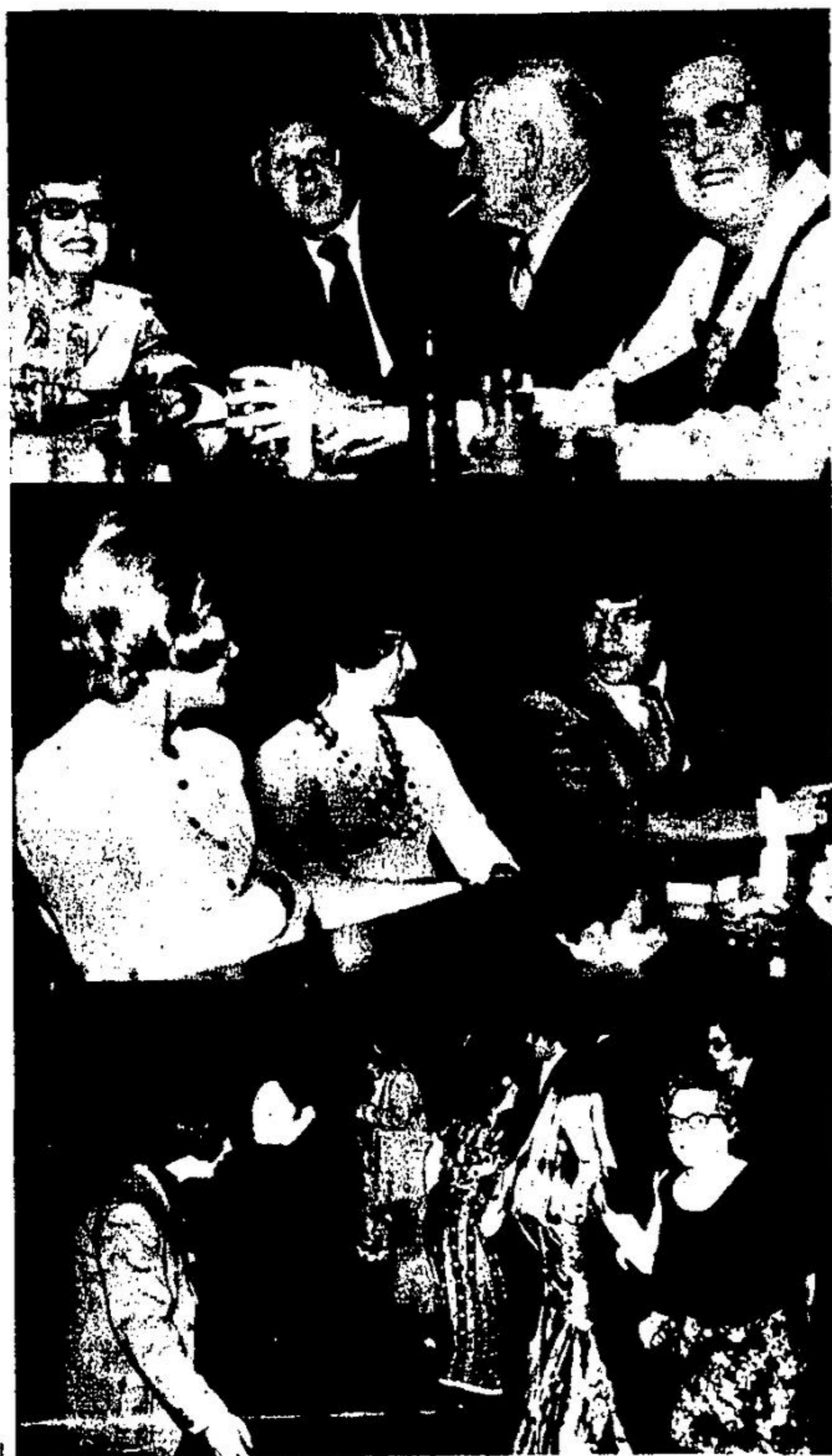
Liberals in a Dancing Mood

As the history books come out millions of words will be written about Leslie Frost. They will talk of a great politician and a man of achievement. But those that catch him most properly will talk of a determined man with an iron hand in a velvet glove.