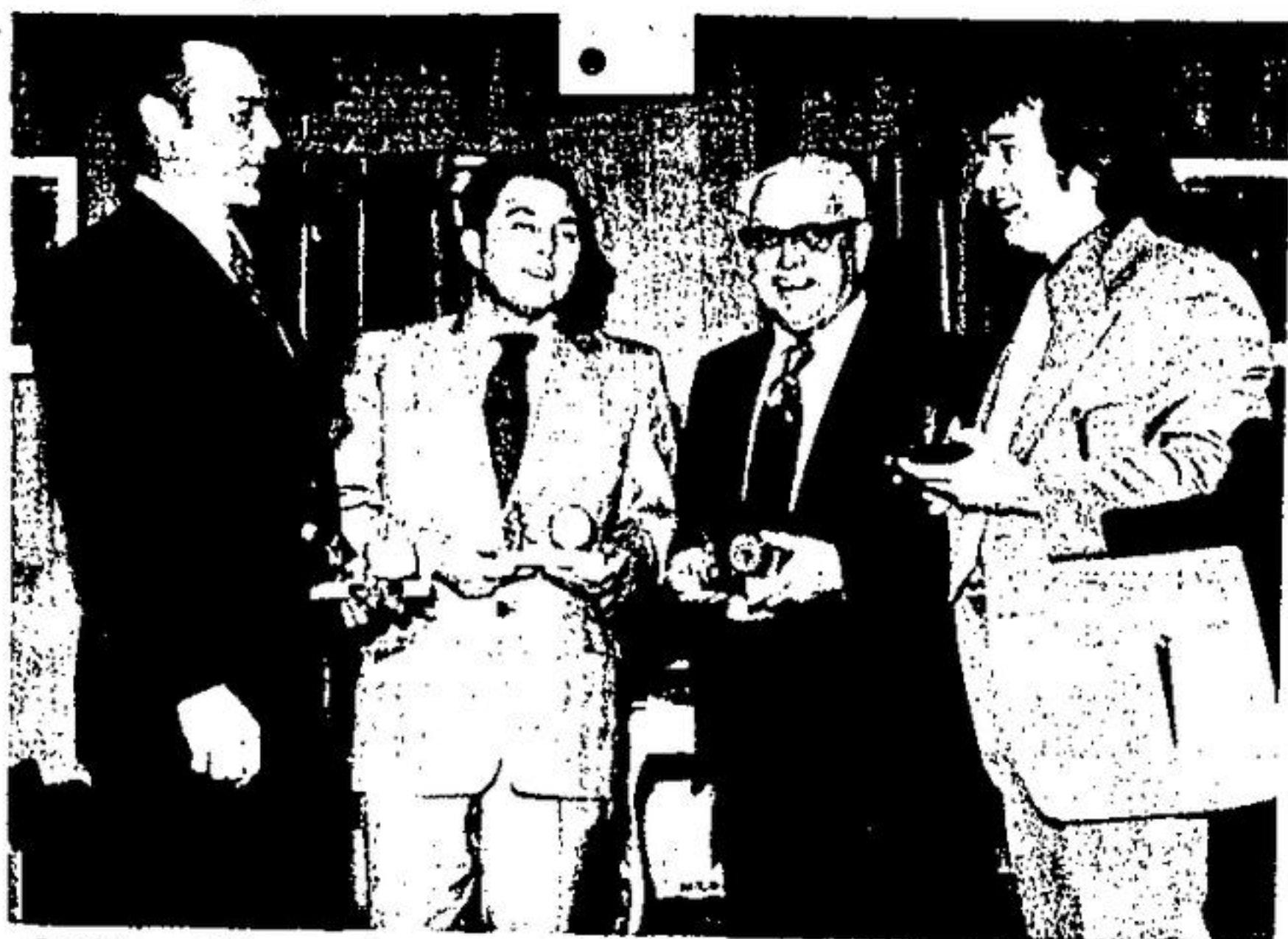
Special recognition awards were presented to a number of members of the Georgetown Raider Hockey Club when the club celebrated its recent Ontario Intermediate A