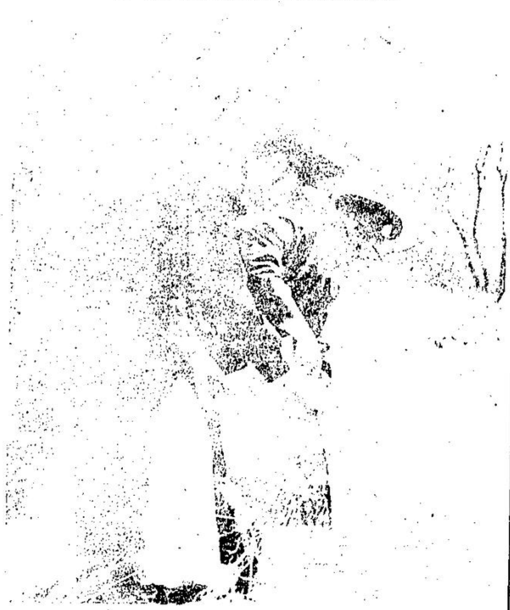
The population of Coho Salmon in the Credit has risen sharply over the past few weeks due to a stocking