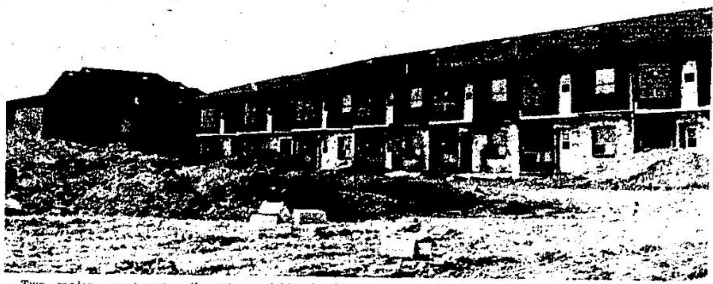
Two major apartment projects are growing as fast as the spring flora in two Georgetown neighbourhoods. Above, the second senior citizens' apartment project on Sargent Road at Mountainview Road South and below, the six storey River View Court apartments on John Street east of Mountainview Road North.