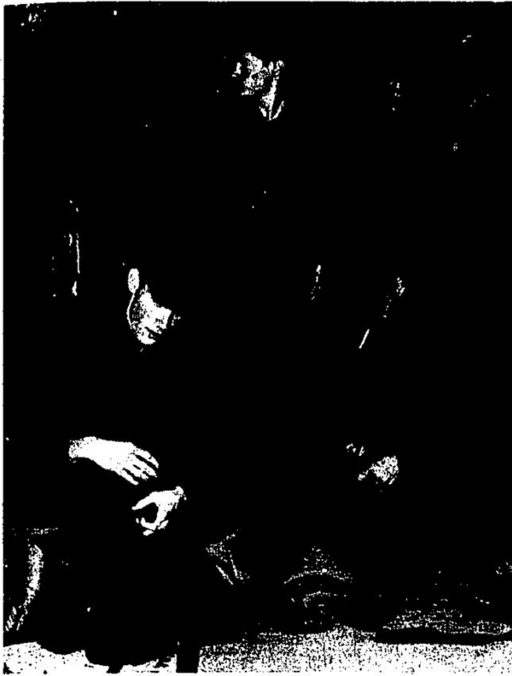
Georgetown's C company of the Lorne Scots furnished members to attend a military expedition to Base Borden, organized by Oakville's A company. Three of the members taking part are seen preparing their gear outside the Georgetown armoury Friday evening before boarding a chartered bus for the base.