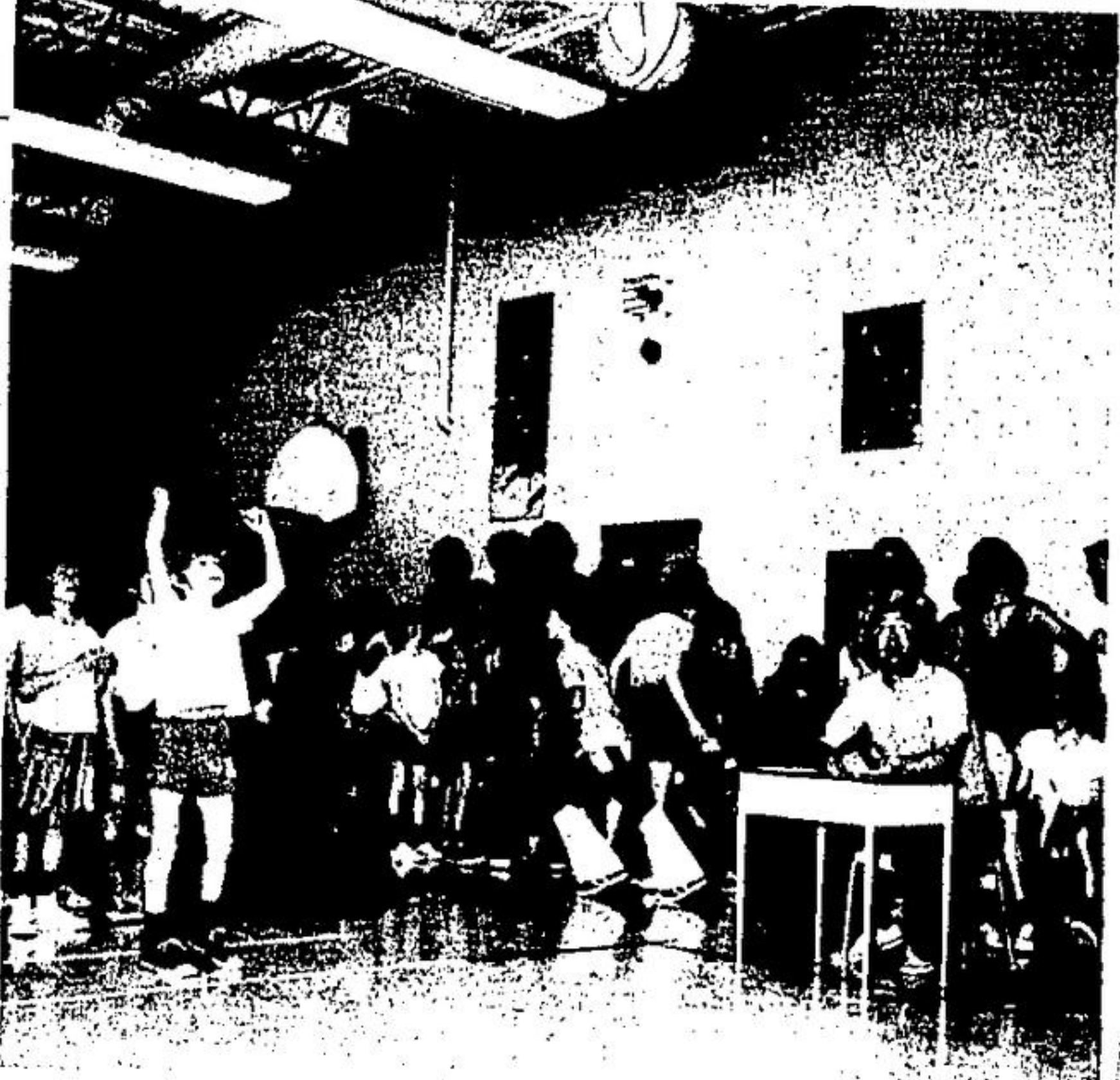
TEST YOUNG CAGERS' ACCURACY.