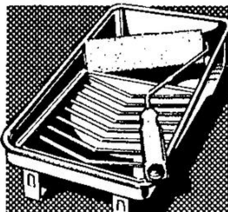
PAINT ROLLER SET

Protect your floors, furniture, lamps and walls against paint splatter.