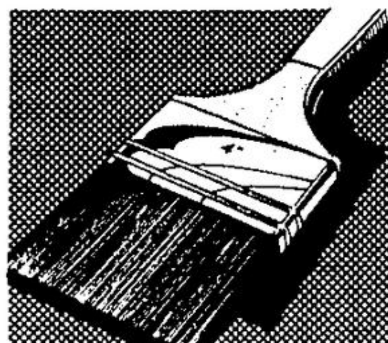
JET NYLON PAINT BRUSHES

Consists of metal tray with deep paint well and 7 1/2" Dynel roller with 3/8" nap. Roller is replaceable.