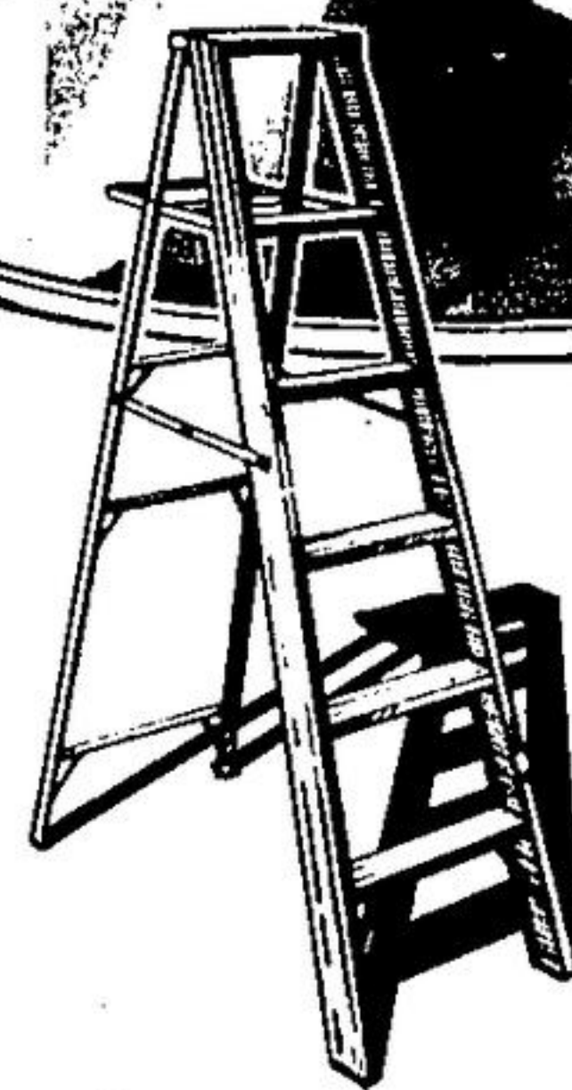
ALUMINUM STEP LADDER

1 1/2" Reg. $1.79 $1.43 2" Reg. $2.13 $1.69 2 1/2" Reg. $2.98 $2.38 3" Reg. $3.35 $2.82 4" Reg. $5.13 $3.99