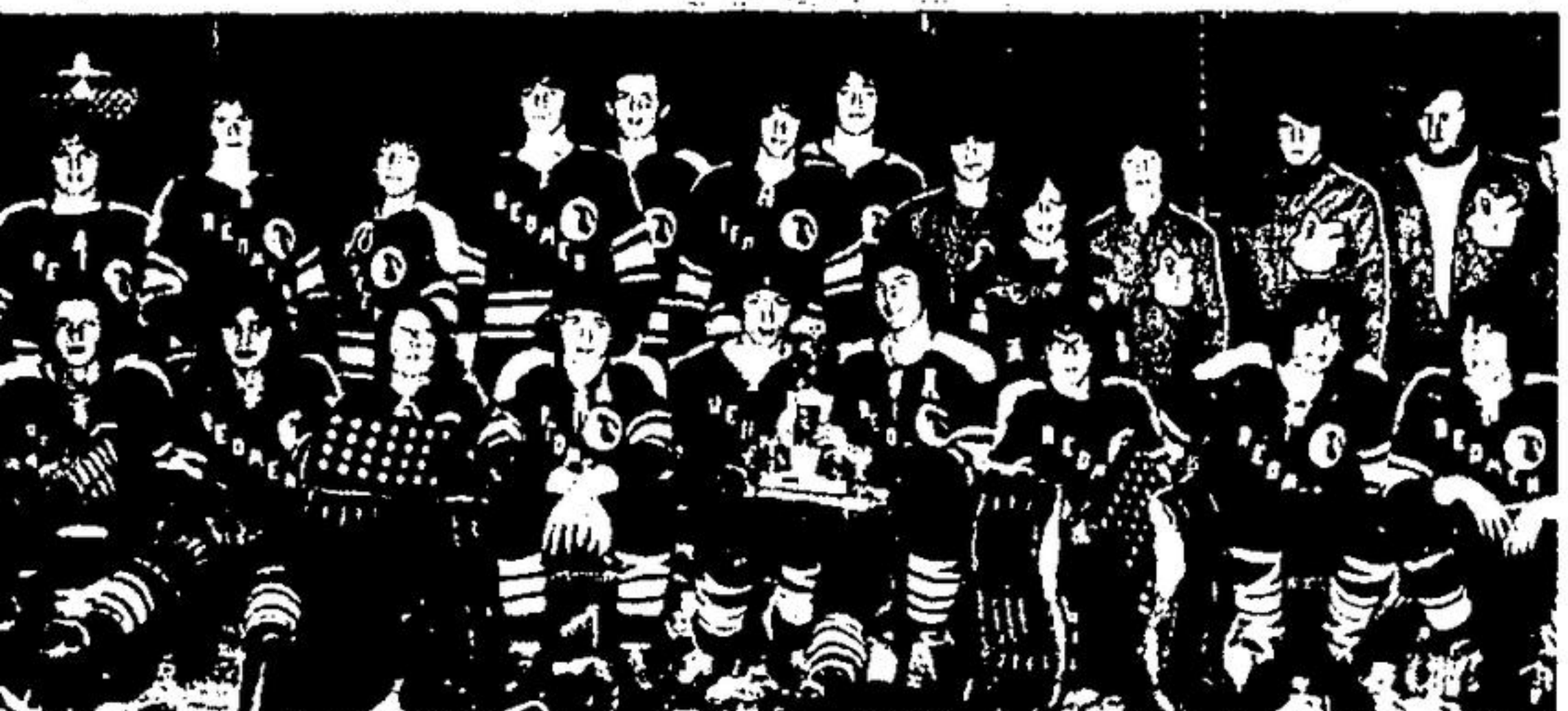
A. Division champions and eventual grand champions, Peterborough Red Wings. B. Division champions Thornhill. C. Division champions Milton. 4. D Division champions Copper Cliff.