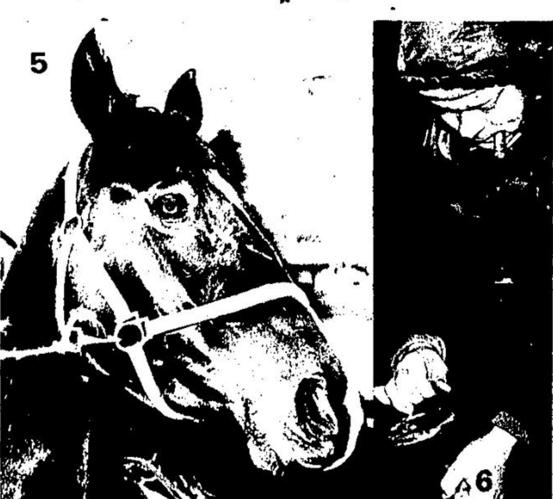
1. Jogging cart is used for the daily workouts. 2. Ed Caldwell gets Callie Spencer ready for the four mile training run. 3. Bob Caldwell applies tar and oil to hooves for protection. 4. Horses are run on the training track in just about any kind of weather. 5. A border, Henry Special. 6. Bell boots are used on trotters to protect against hoof injury.