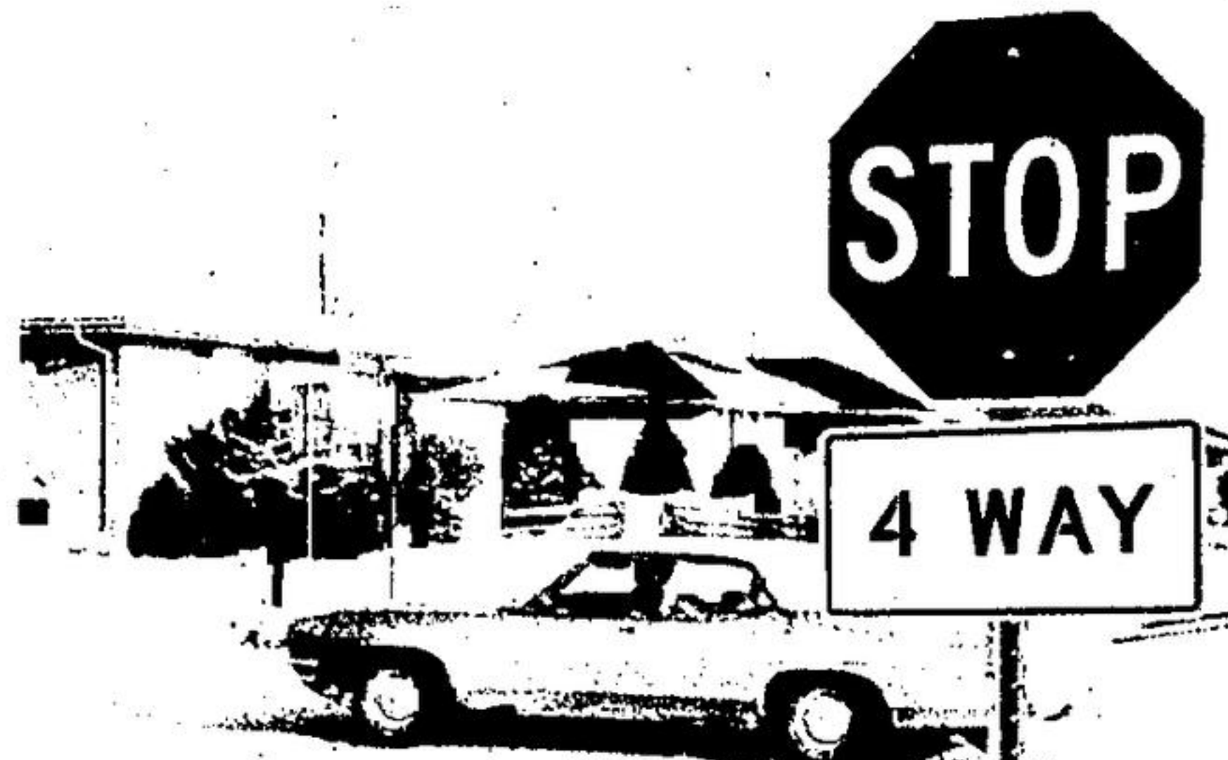
"ALL-STOP" CORNERS AT FOUR LOCATIONS

During the early part of January, new 30 by 30 inch stop signs were installed by the works department at four Georgetown corners. This was in compliance with a by-law passed by council November 30, 1972.