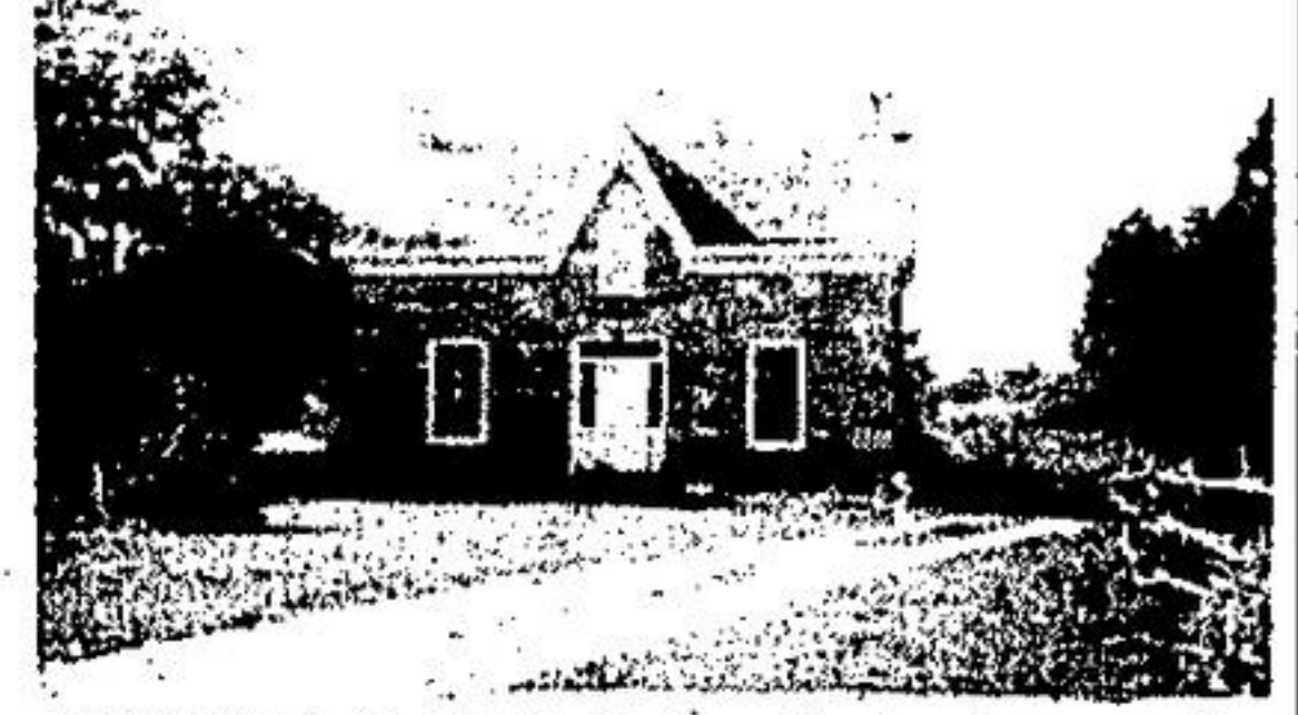
MINUTES—to Go Train. Century old stone home on 3 1/2 acres with barn and drive shed, 9 room home has been recently renovated with heating, plumbing, wiring, 3 baths, etc. Priced $72,500.00

MEMBERS OF TORONTO, HAMILTON, KITCHENER, MISSISSAUGA, ORANGEVILLE AND BRAMPTON REAL ESTATE BOARDS