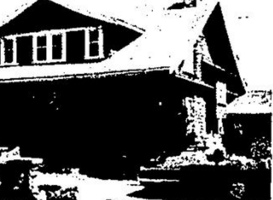
AGELESS—beauty describes this fine Old English manor house. List of features are endless, but here are just a few - 7 bedrooms, 3 baths, 2 fireplaces, den, dining room. Private ravine lot with sun deck and pool $51,900.00