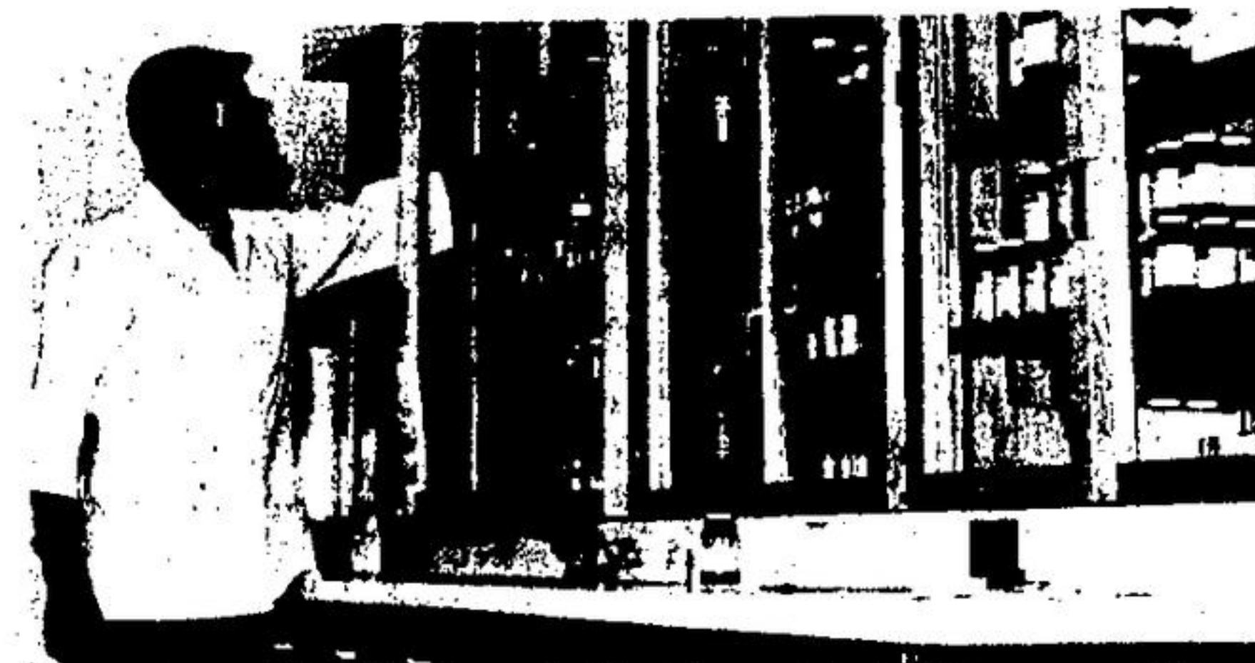
Clinic includes a complete pharmacy.