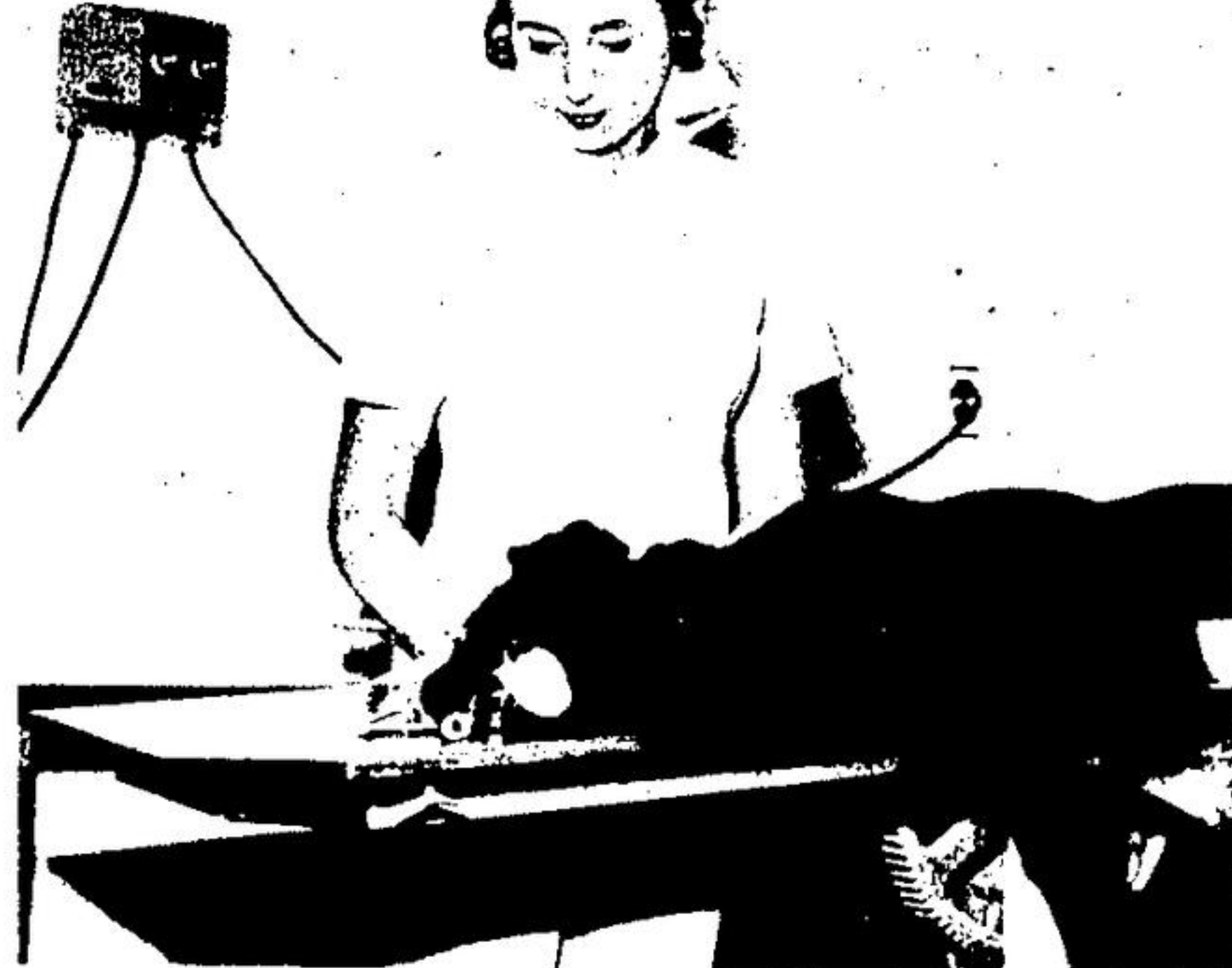
A focal point of the new clinic is its facility for surgery.