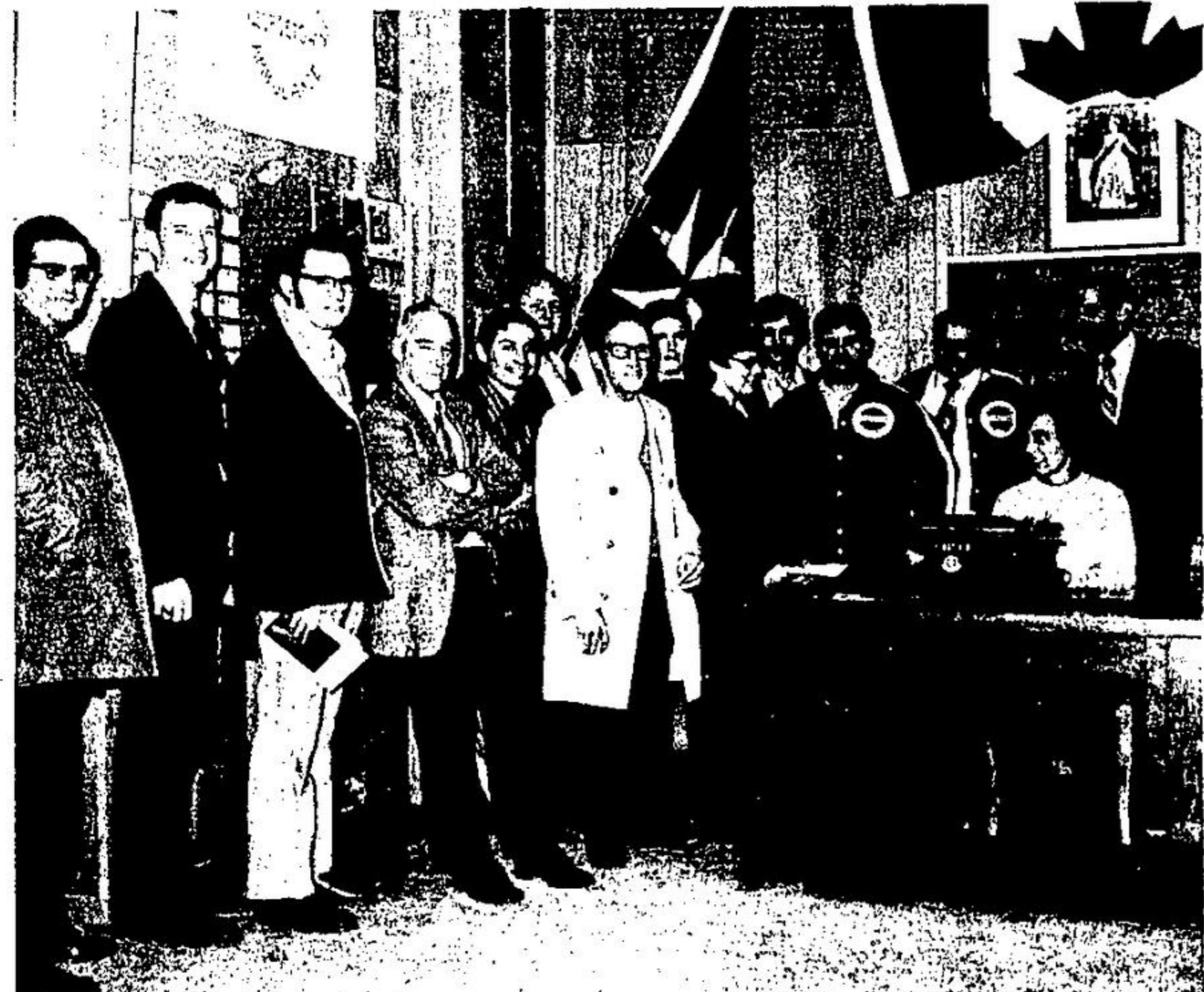
TWENTY-FIVE SIGNED UP FOR ST. JOHN FIRST AID TRAINING COURSE.

For a limited time only save hundreds of dollars on your new home or cottage with Hallidays Early Bird-Early Build Discounts. Choose now from 35 custom manufactured homes... 12 different cottages... Your Halliday Dealer has it all together—mortgage money, lot assistance, computerized construction, erection crews and Early Bird-Early Build Discounts. See him today and save. HALLIDAY HOMES DISPLAY COURT 551 Maple Avenue, Burlington, Ont. Phone 637-5261