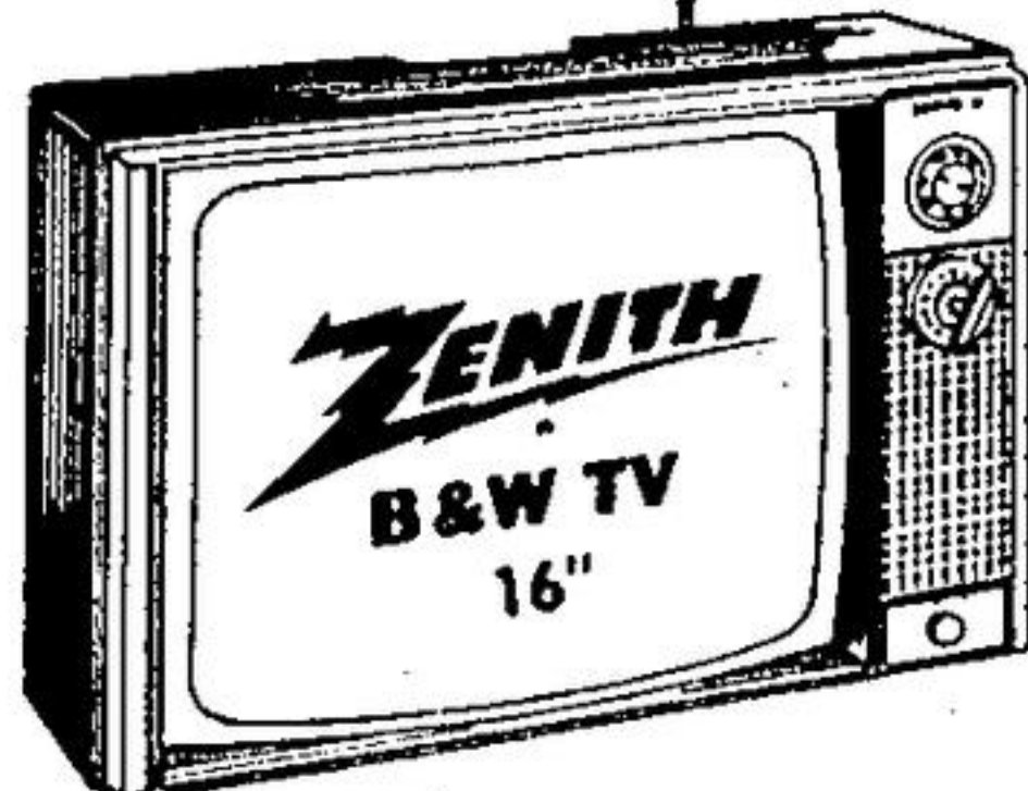
The SEAVIEW • D1835 America's most distinctive portable TV! Zenith Quality Chassis featuring Zenith Solid-State Modules. Colors: Dark Brown with Beige or Yellow color. Solid-State Custom Video Range Tuning System. Monopole Antenna.