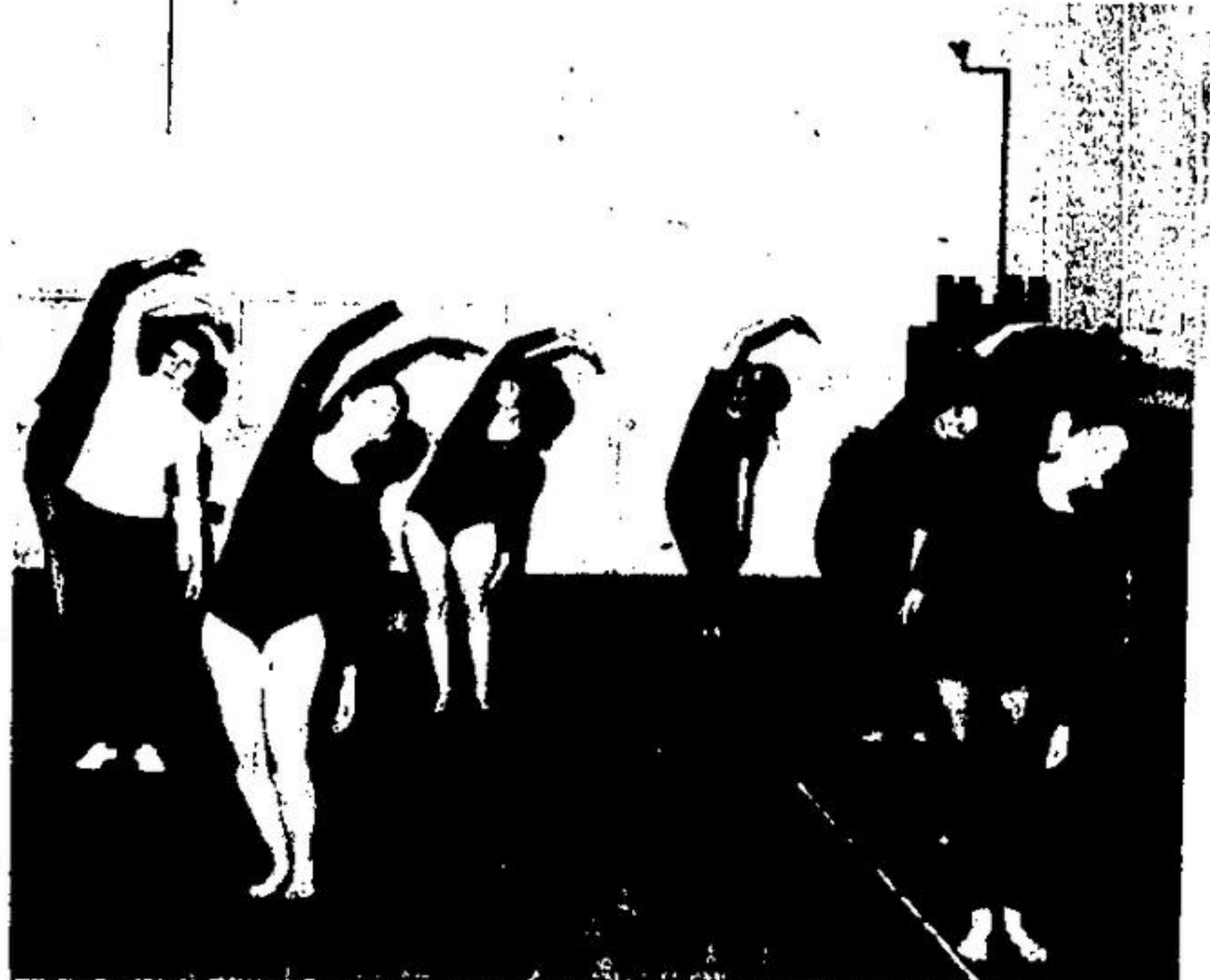
IN ESTONIAN GYMNASTICS MUSIC ACCOMPANIES EXERCISES.