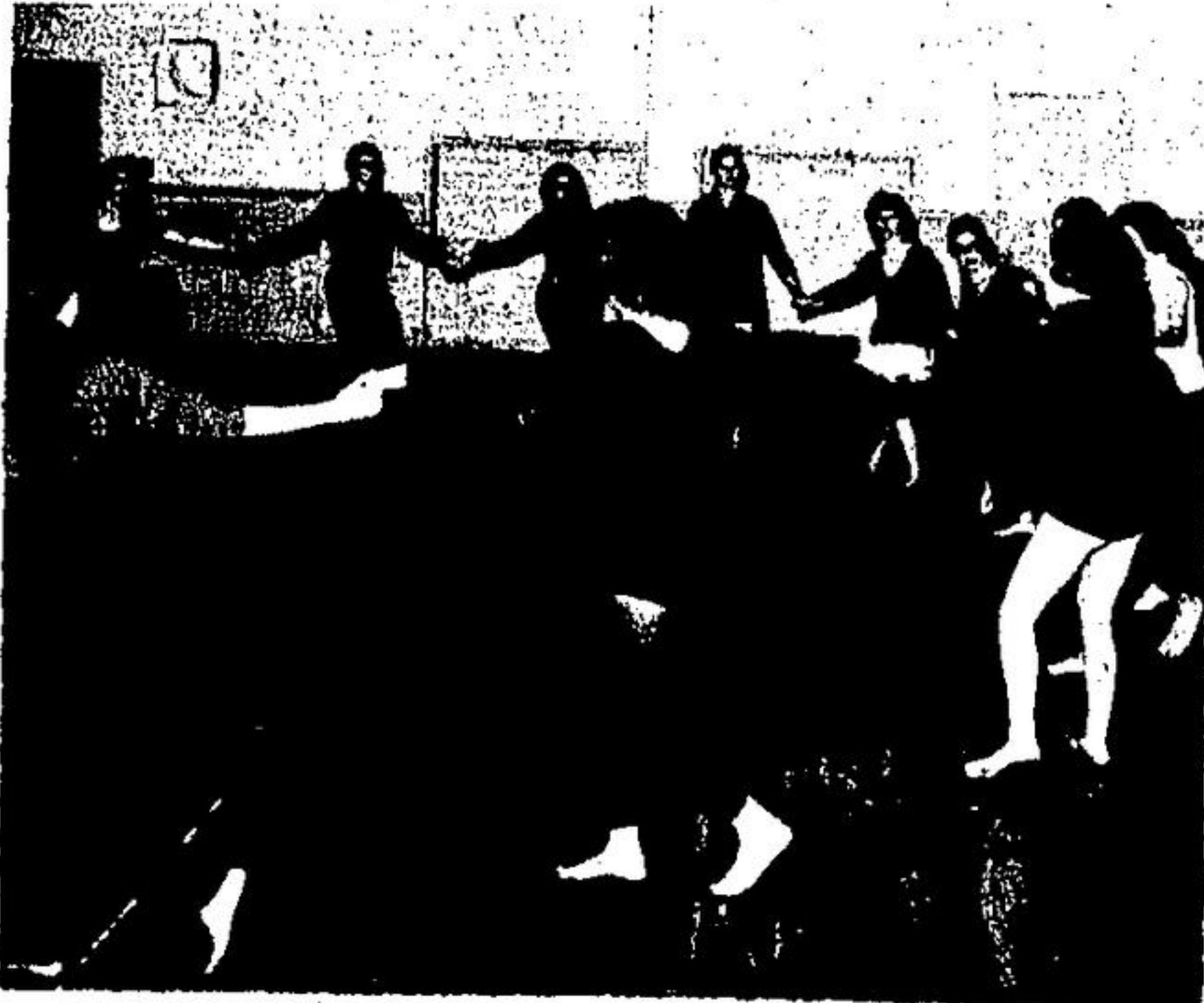
ESTONIAN GYMNASTICS FOR WOMEN STARTED LAST WEEK.

Georgetown Y is in its 11th year and January 15-21 is "Y" Week. "People...Helping Change Happen" will be the theme to be jointly marked by YMCAs and YWCAs in 99 communities across Canada. Georgetown Y has no special programs planned for this year's festivities. Yoga classes, pre-school gyms, Ladies Take A Break, modern gymnastics, chess clubs, ski lessons, badminton, and swim classes are some of the winter programs to be started or expanded. There are 800 participants now involved in the various clubs, with 20 instructors on staff. Committees for the clubs are composed of volunteers from the community. Programs are held at Georgetown High School and area churches.