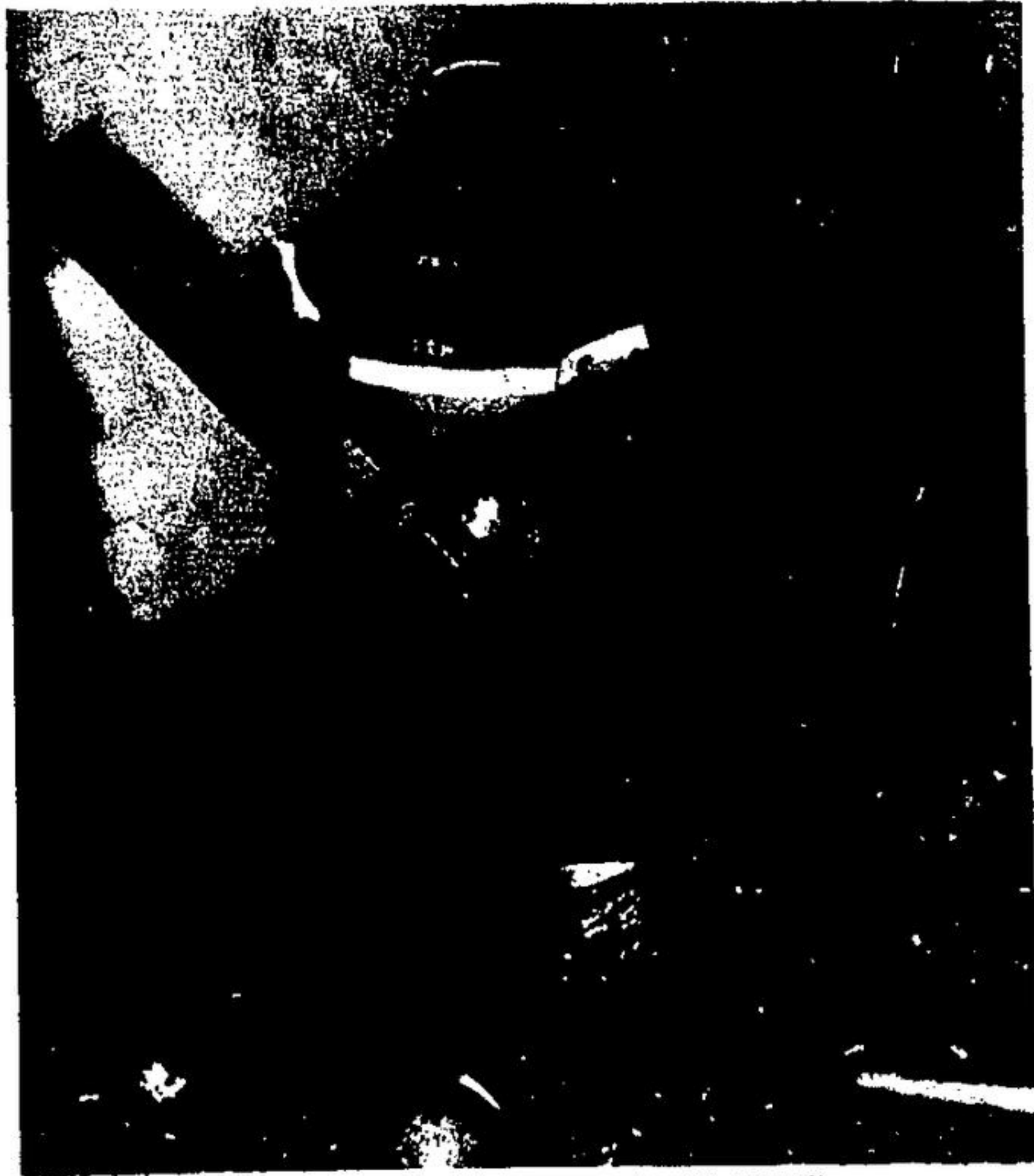
FIREMEN SIFT THROUGH RUINS OF RAZED OFFICE.