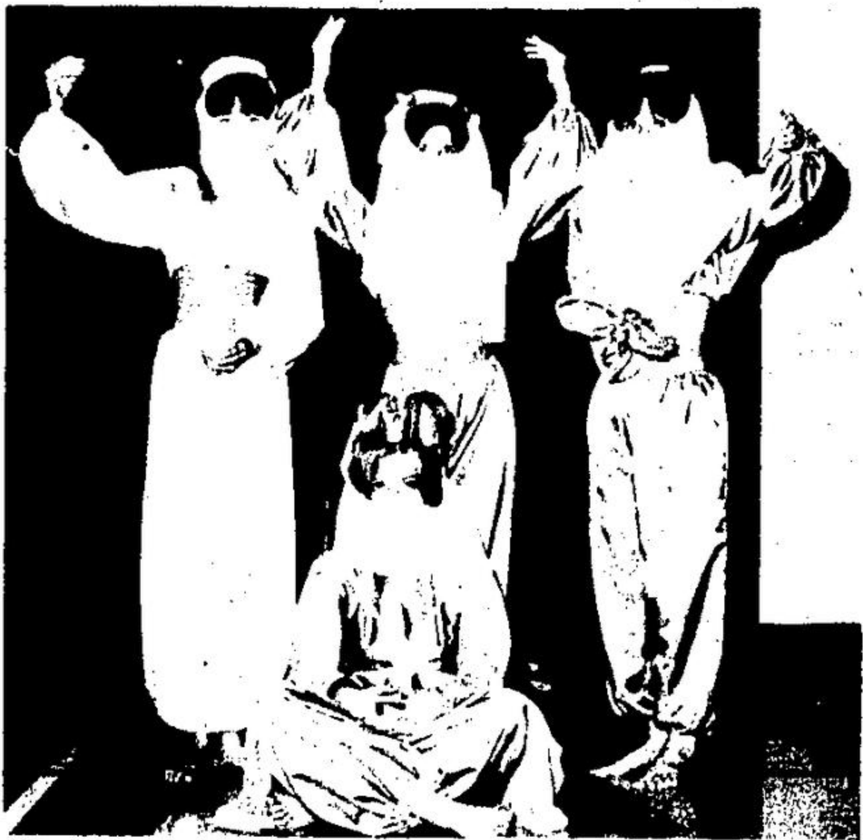
Elaine Turkington is Sheharazade (front) in