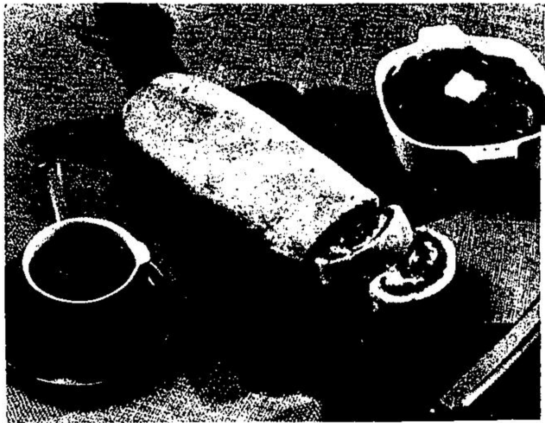
Lamb-in-a-Blanket, tender and tantalizing, makes a welcome addition to hearty winter meals.

As the winter scene unfolds, even food makes seasonal adjustments to the snow storms and chilling winds that we have to face huddled in overcoats and scarves, boots, gloves and hoods. New Zealand Spring Lamb meets the icy blasts of Canadian winter in an appropriate way as Lamb-in-a-Blanket, a delicious combination of pastry wrapped around chopped lamb flavoured with onion and mushrooms.