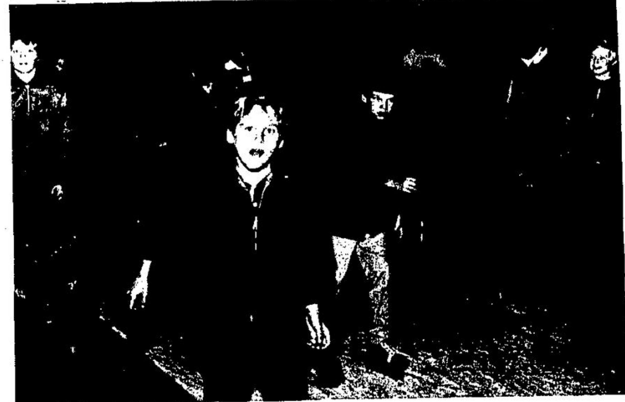
Georgetown schools make good use of arena ice.

Gosling told The Herald that while some ice time during the mornings of Monday through Thursday shows up on the regular weekly ice schedule as "available" much of it is taken up by schools and organizations which don't use the arena every week.