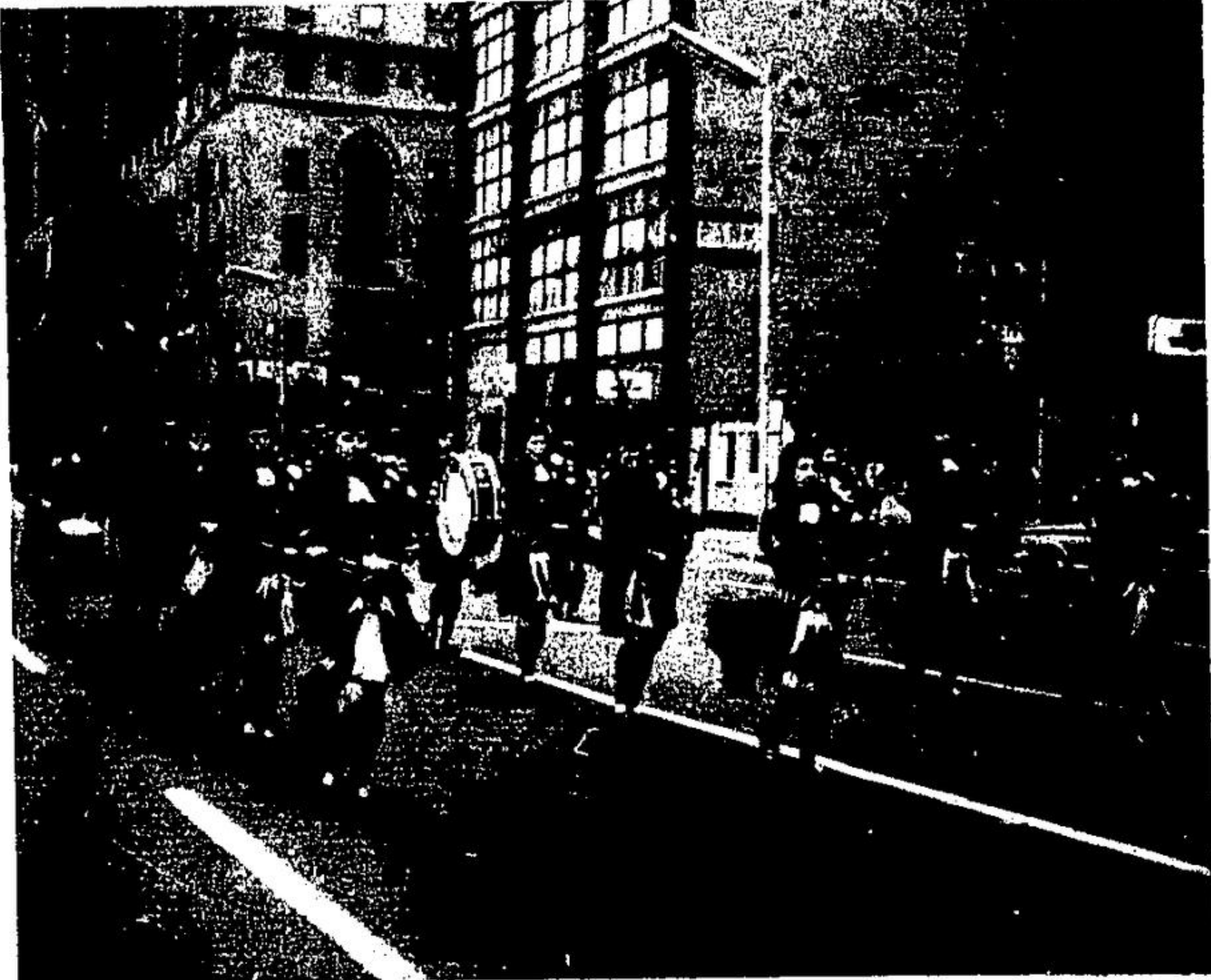
Georgetown Girls Pipe Band were at the front of a parade from the Royal Agricultural Winter Fair to