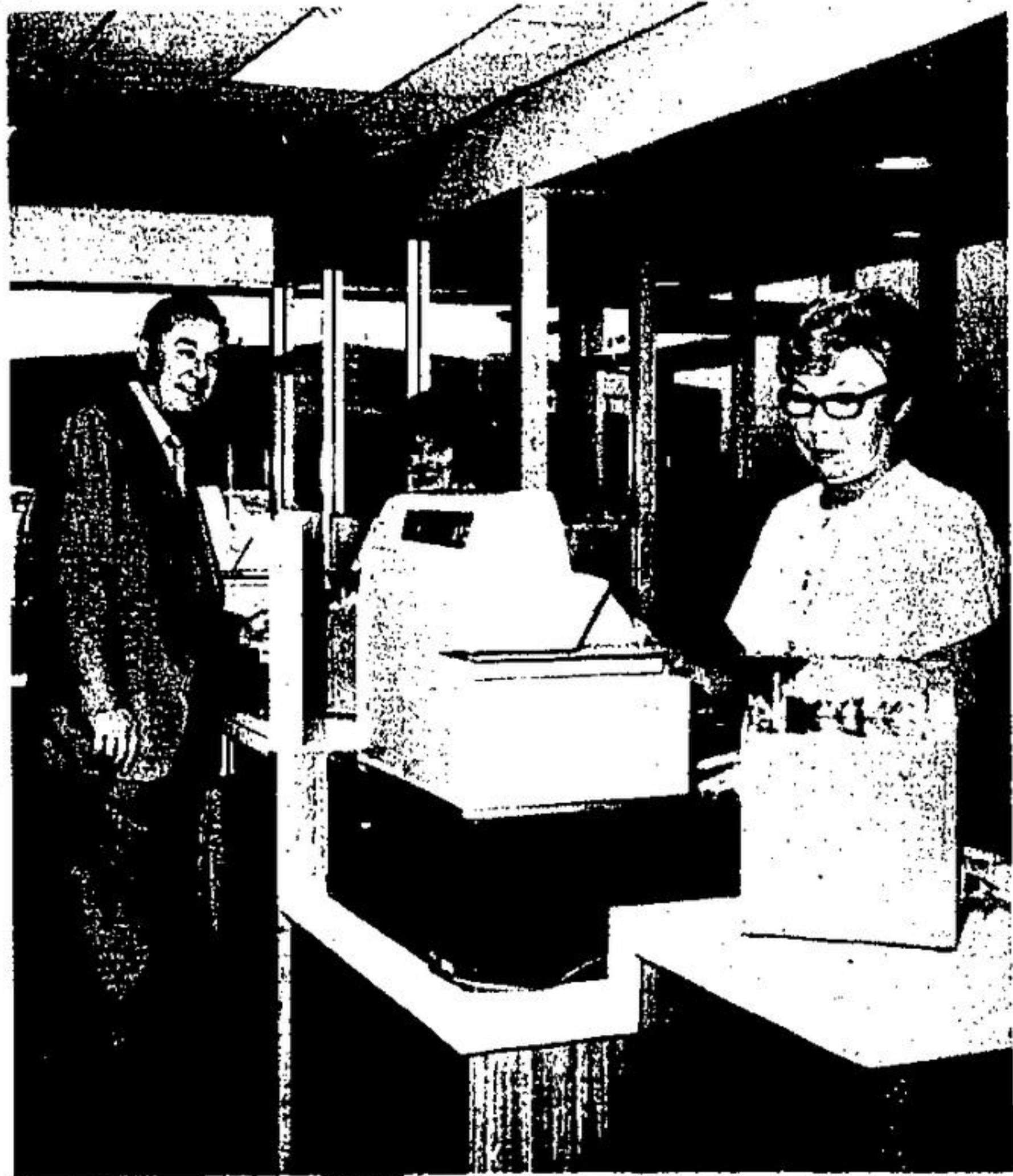
WOMEN ON THE TILLS