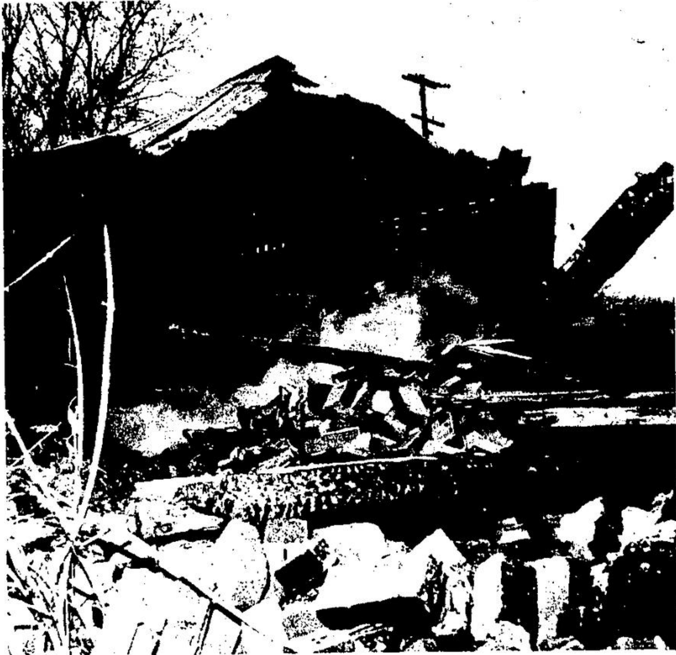
RUBBLE HEAP WAS FARMHOUSE

A pile of smouldering brick was all that remained of an old farm house near Ballinafad when the sun rose last Wednesday morning. A fire of unknown origin levelled the house during the night. It had been vacant for two years. The house, on the 8th Line of Esquesing just south of the Ballinafad Sideroad, had been frequently hit by vandals.