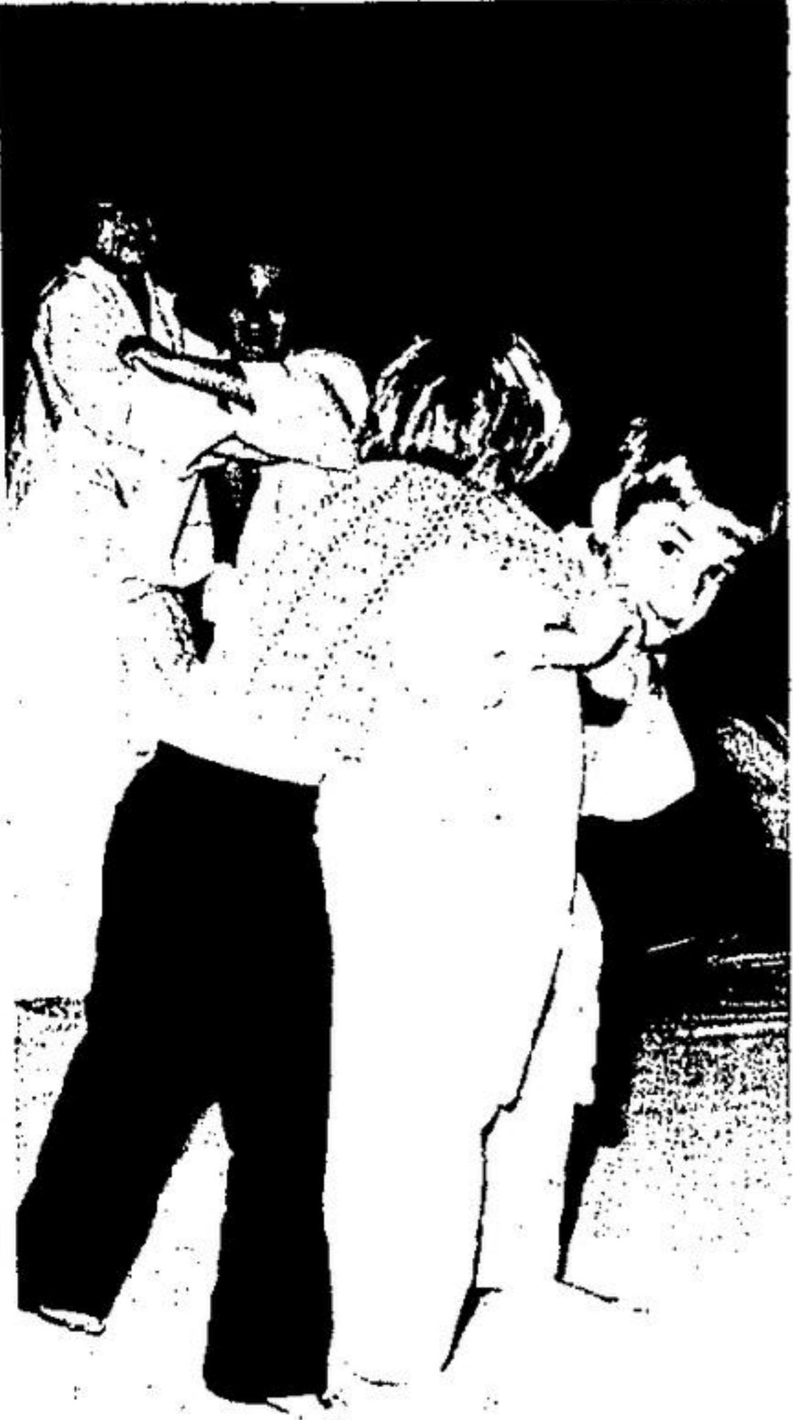
Even the very small enjoy Judo classes.

as I sit here at the dojo (practice hall) or better known to you as the Rose Room, I see before me 60 enthusiastic young Judoists hard at work learning the skills of Judo. In a half an hour myself will be out there with 20 other senior members. Right now, however, the juniors are on the tatami (ta-tam-ee) or mat, ranging in age from 6 to 16. Seniors range in age from 16 to — (the old man won't tell; and ladies never tell!) New members are joining each practice session; and why