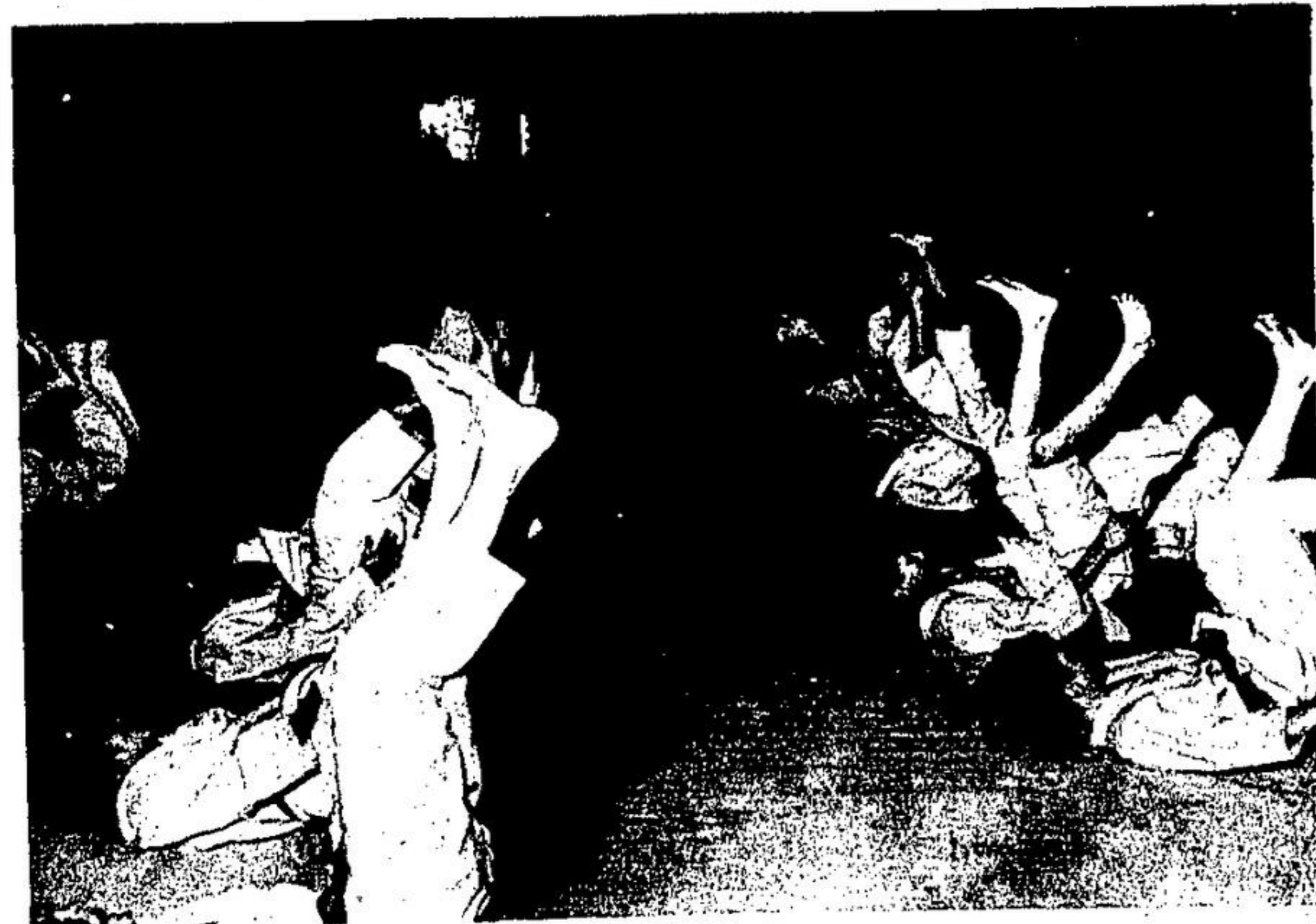
A Budokan Club session at the Memorial Arena's Rose Room.