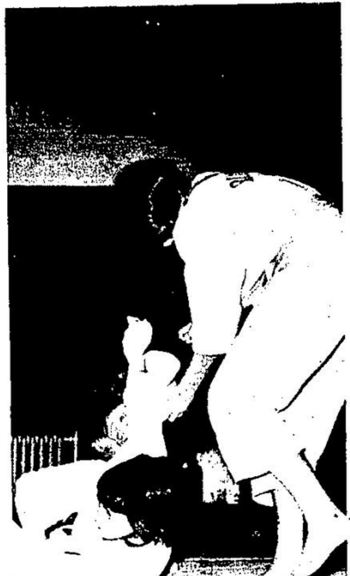
Judo has had women's lib for years.