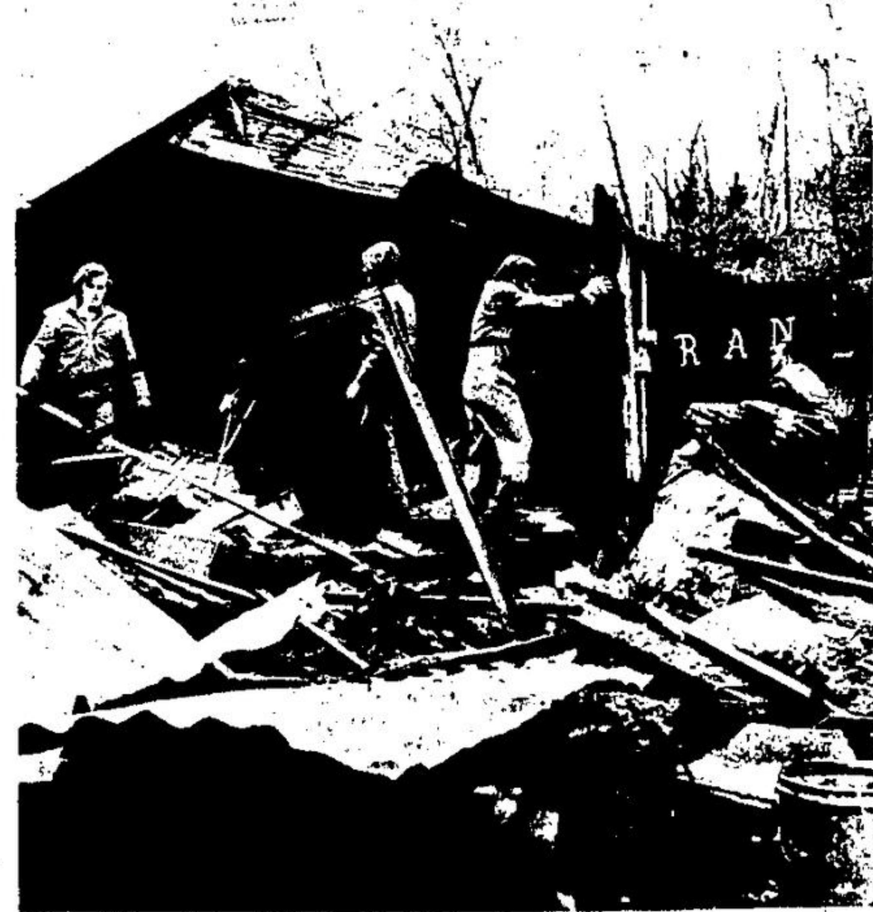
Car Club members salvage what they can from ruins.