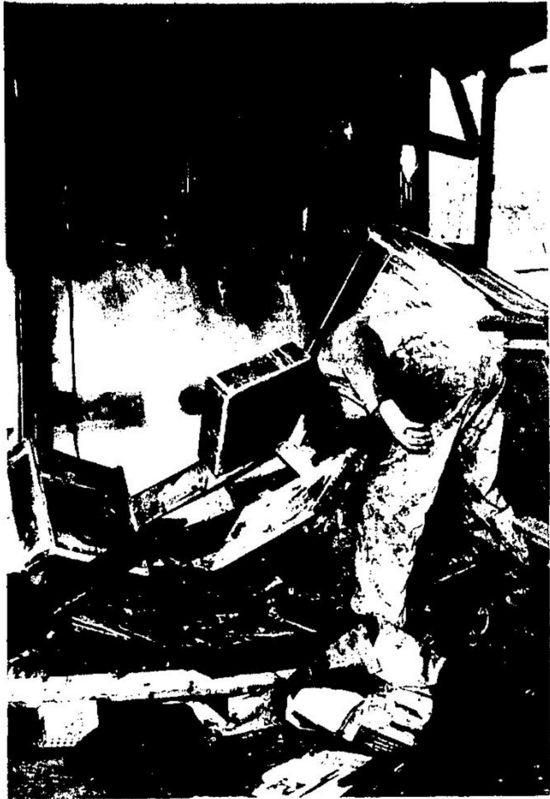
Early morning fire completely destroyed Random Car Club's Glen Williams quarters.