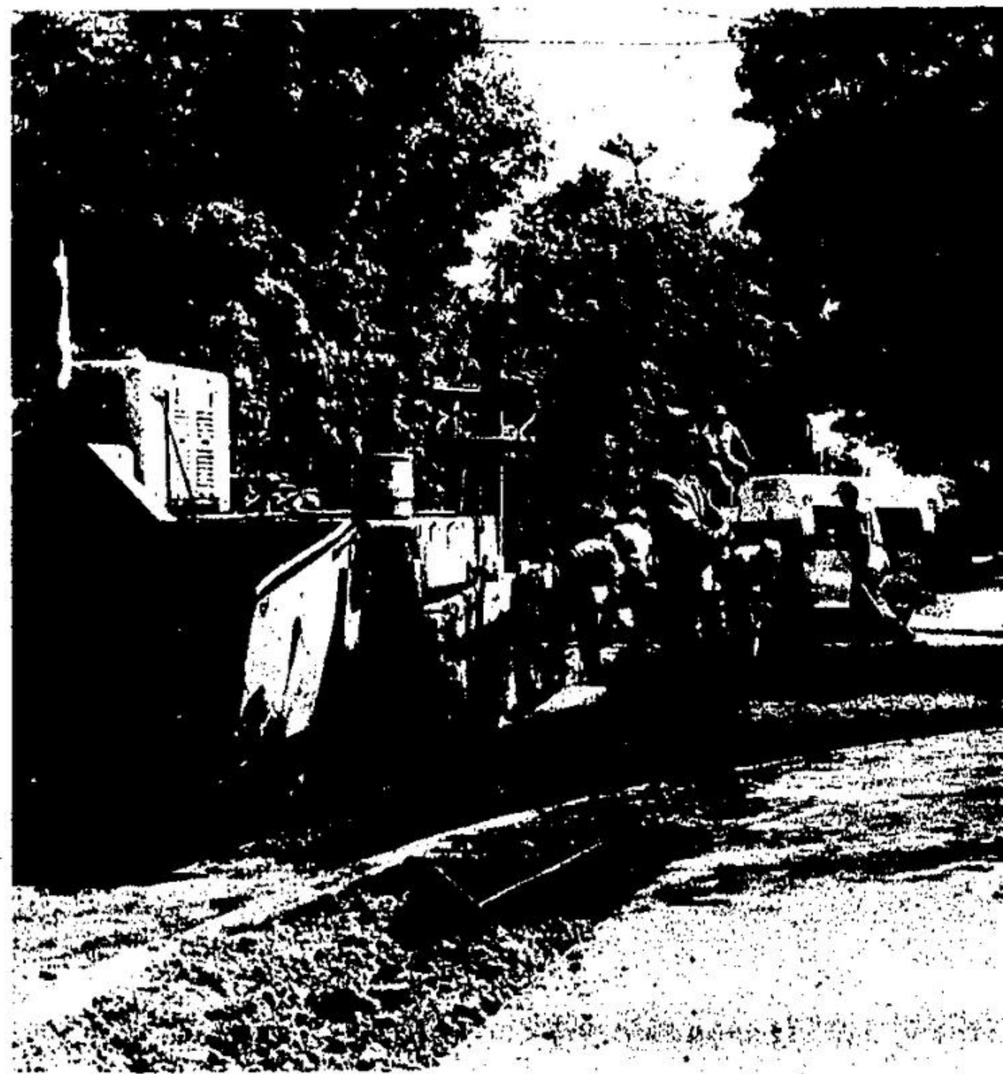
Reconstruction and paving is completed on Charles and Park. Sodding is expected to be completed this week with an asphalt coat to go on the torn up areas of Edith, William and Market. Storm sewerage has begun on Duncan and Weber where actual reconstruction start about