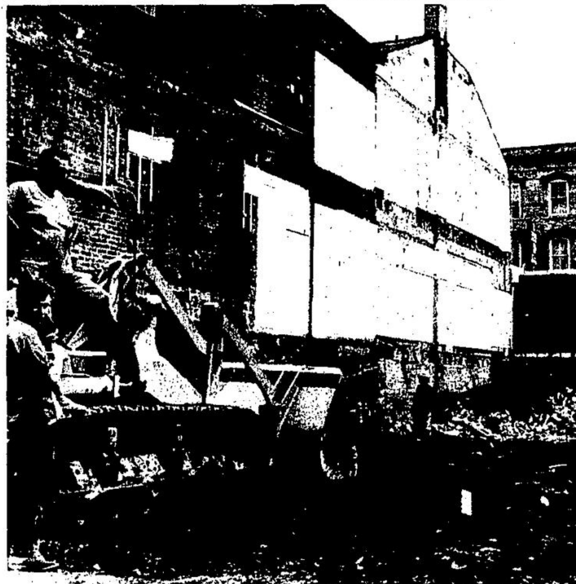
Royal Bank will locate in building that will rise here.

has just been only commenced valued at $1,000,000.