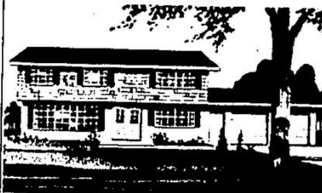
Model illustrated "Burlington" — Living Area 1800' — 4 bedrooms

Well-planned interiors, attractive styling, sound structural engineering to N.H.A. and V.L.A. requirements... plus the substantial savings made possible by modern mass purchasing and assembly-line production techniques—these are the ingredients that have kept Colonial/Sunnibilt in the forefront of the Manufactured Home Industry for all these years!