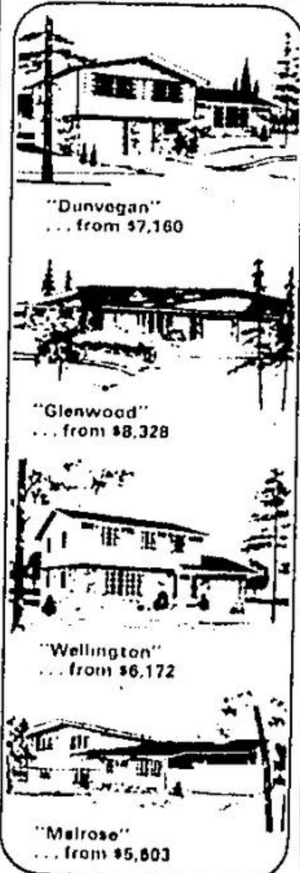
"Dunvegan" ... from $7,160