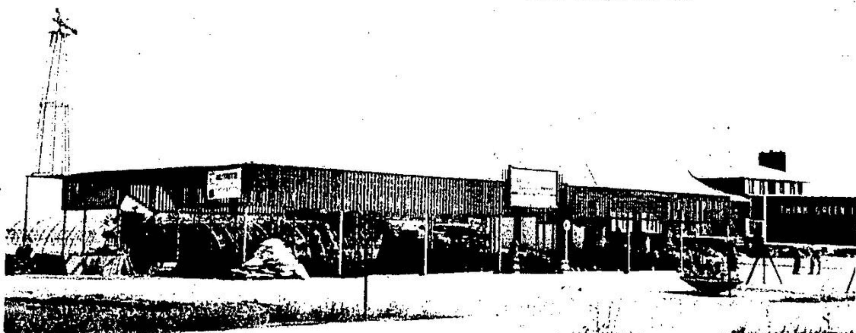
Dutch Landscaping and Nurseries was site of Wednesday tour.

Nurseries on Highway 7, where they had lunch, and Humber Nurseries.