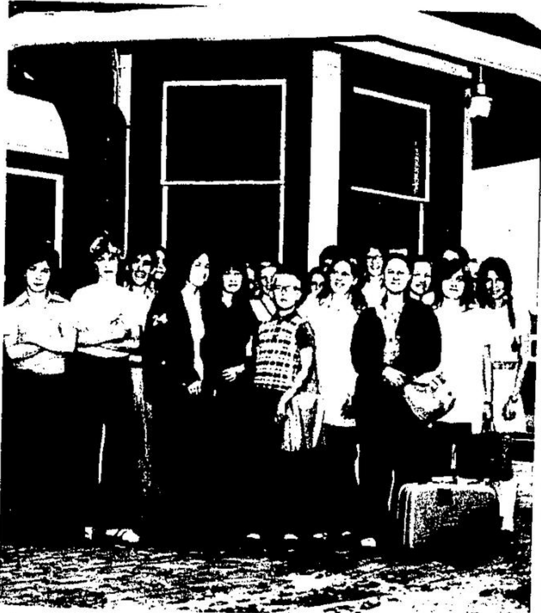
Just back from Quebec, 13 Georgetown high school students and their French-Canadian guests at the CN station.

The inter-provincial student exchange visits are sponsored by the Canadian Council of Christian and Jews.