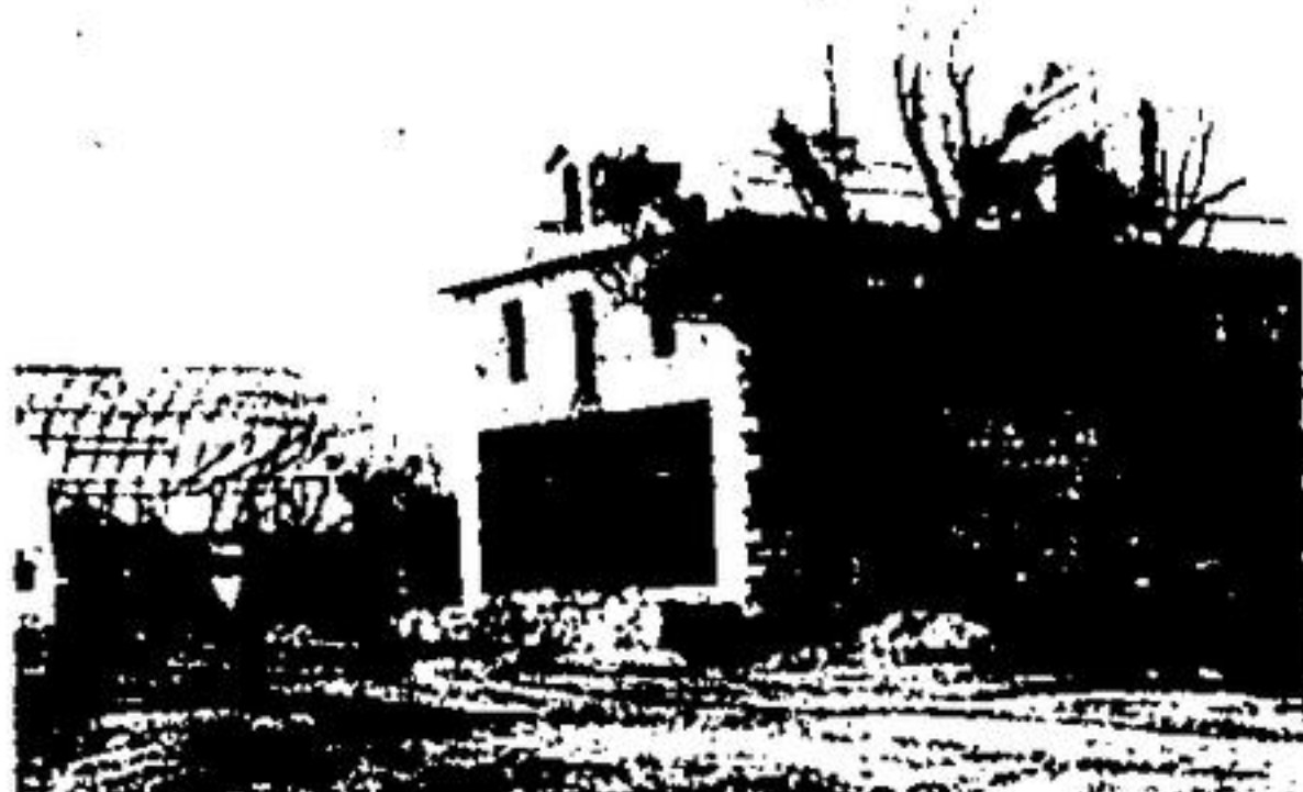
Store and barn under construction after fire in 1905.