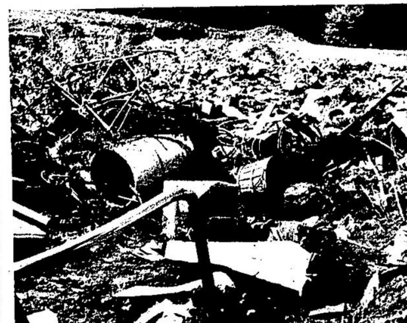
A sea of garbage topped with a layer of bedsprings, washing machines, lawn mowers, mattresses, bicycle frames and just about everything imaginable. That was the scene at the Georgetown sanitary landfill site Saturday after the town's successful clean-up day.