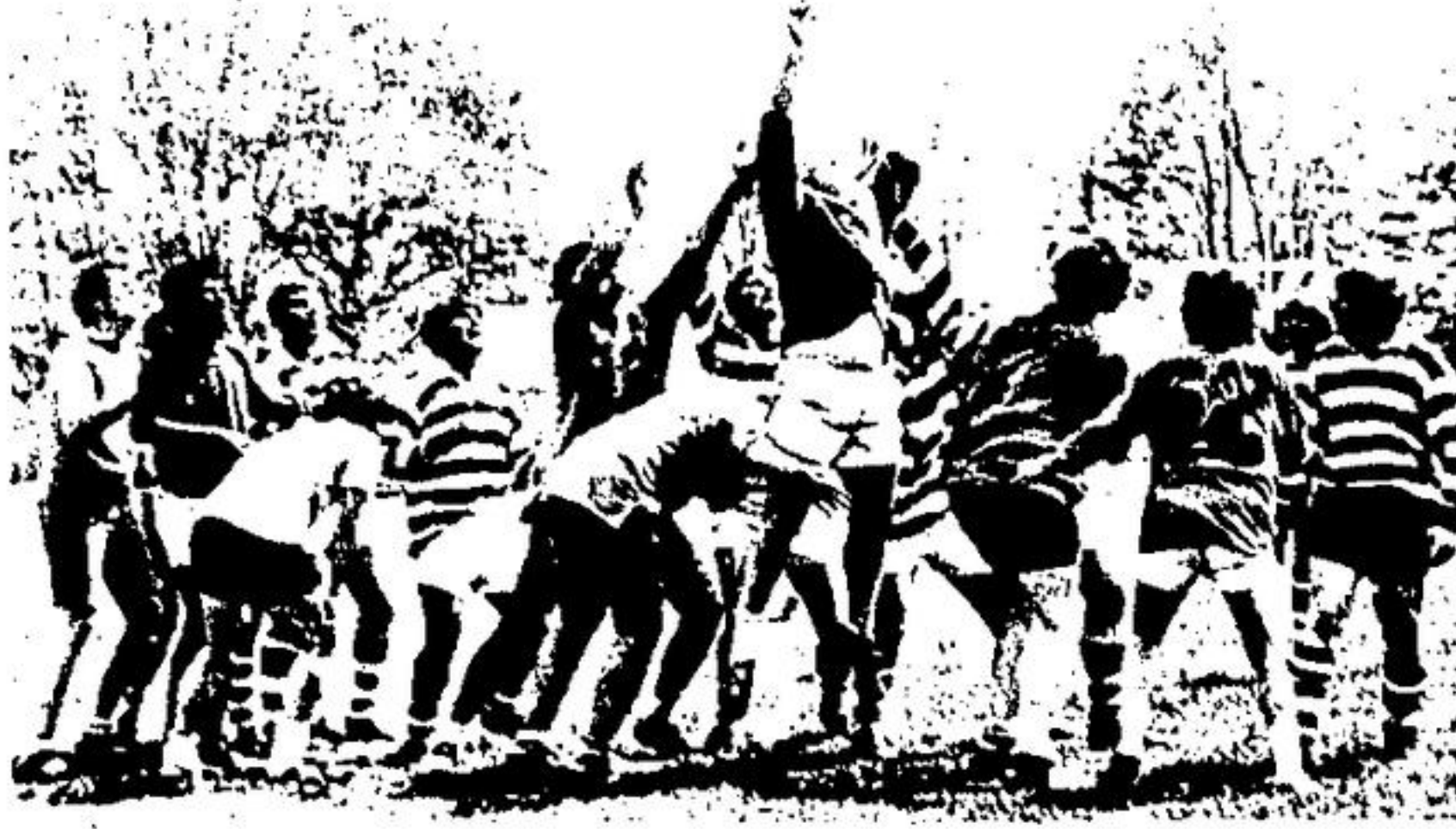
Rugger action in Georgetown Park, Sunday, produced a 6-6 tie.