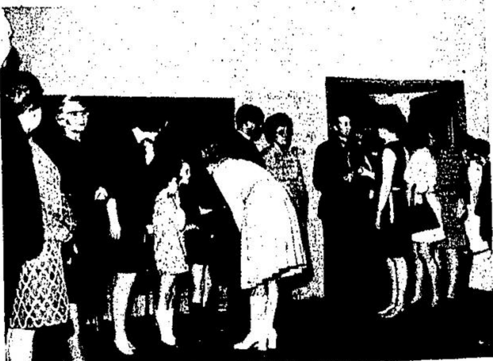
A reception in Knox church hall follows the Wednesday induction service.