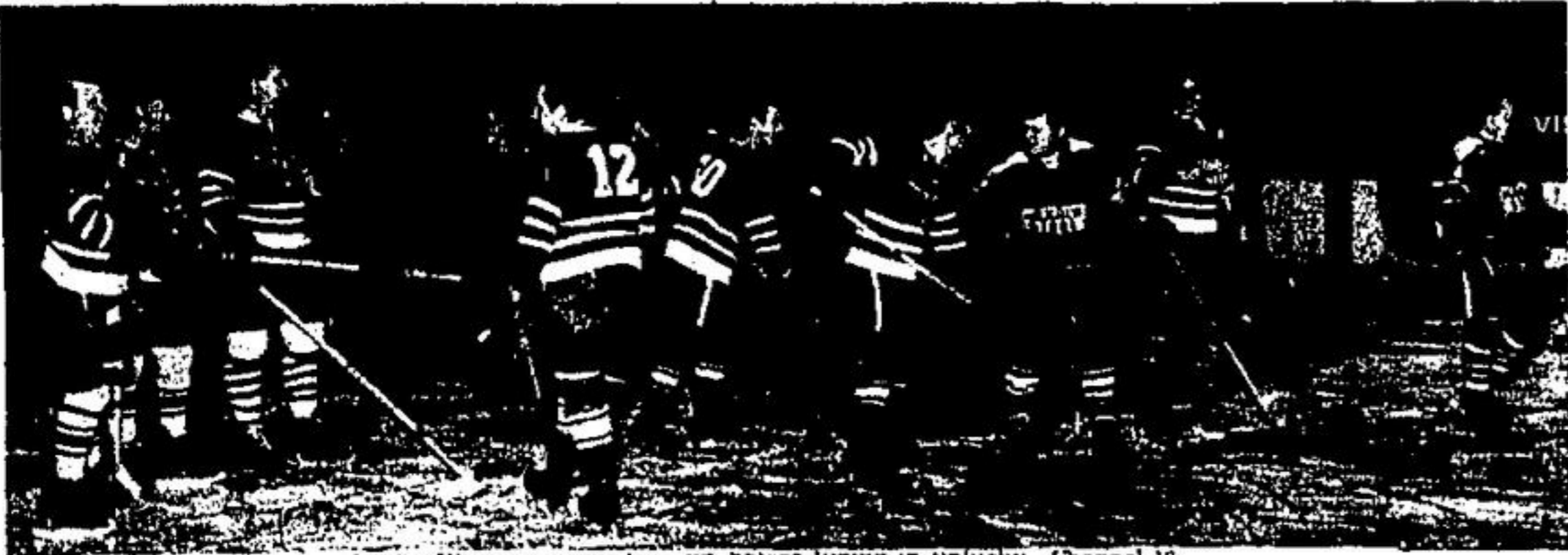
Legion-Kin stars warming up before tuning in unlucky Channel 13.