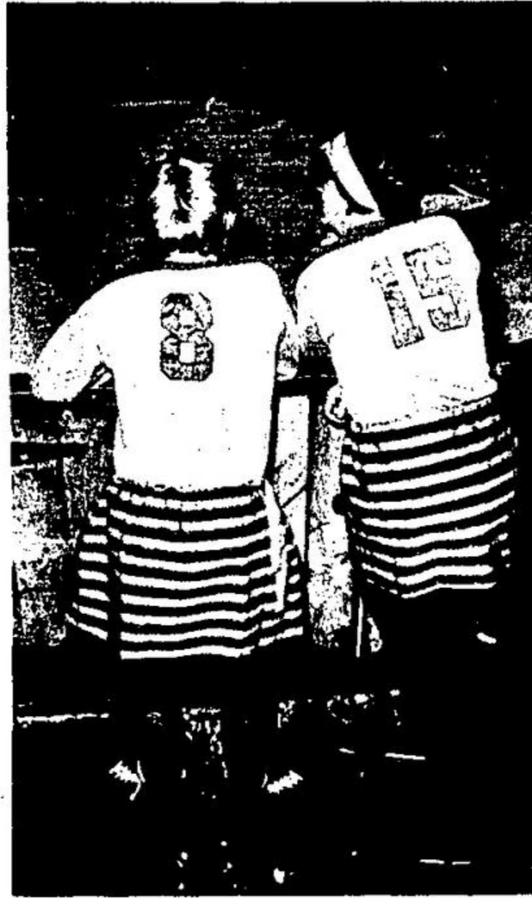
Maple Leaf Gardens has its usherettes.