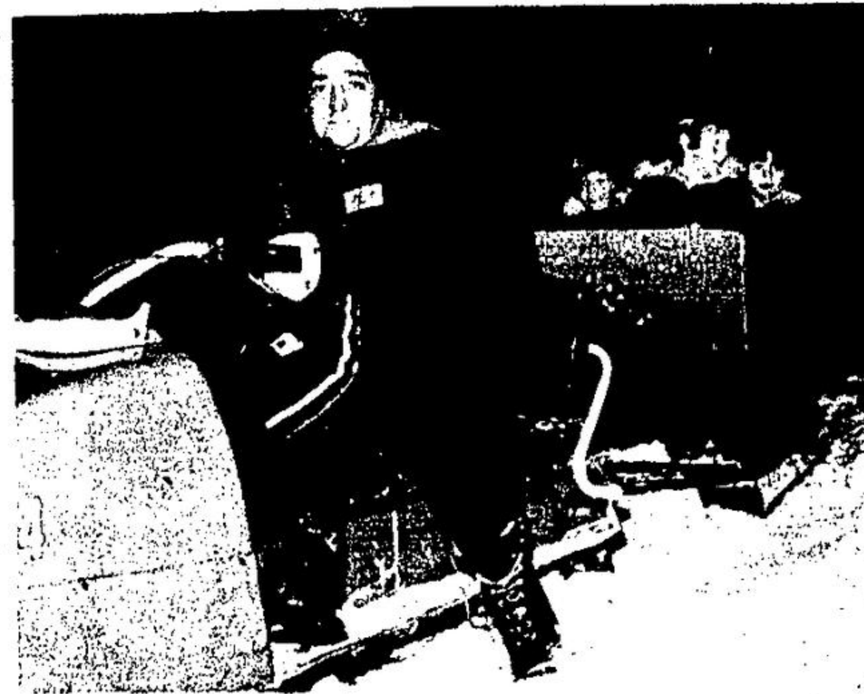
Passengers had just as much fun riding with the "engineer" as in the caboose.