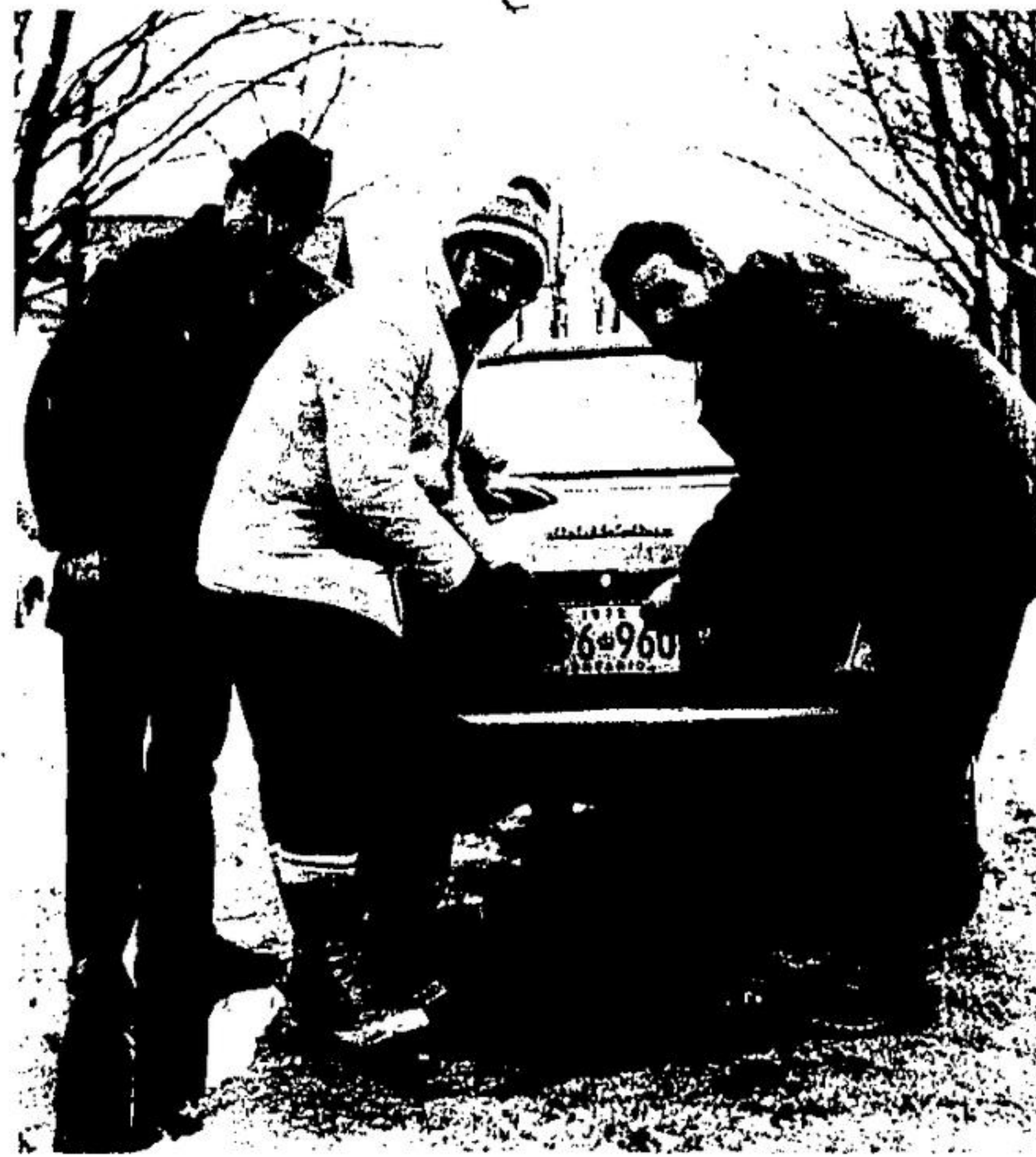
Serving Up Their Cold Plate Special