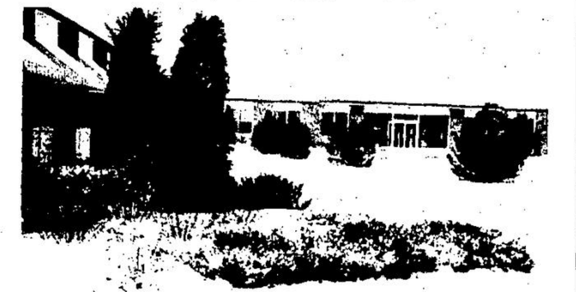
Georgetown hospital would be first to benefit from grant increase.