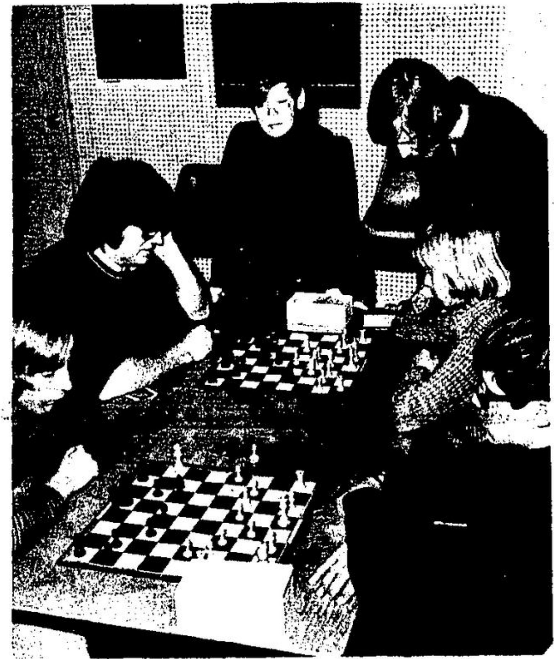
The brains are in high gear as the Georgetown Chess Club's nine week tournament gets underway. Clockwise