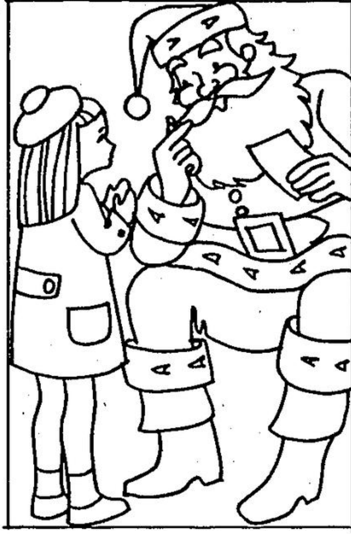
Watch Santa listen with great joy, As a good little girl asks for a toy.