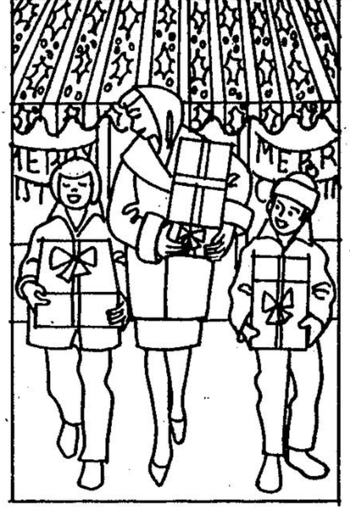
Christmas shoppers have lots of fun As they buy presents for everyone.