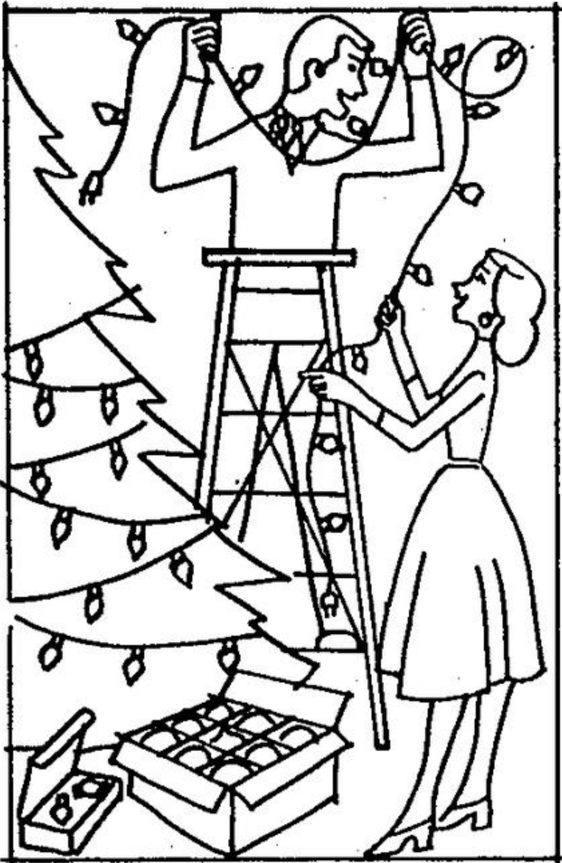
Everyone's anxious to trim the tree To make it beautiful for all to see.