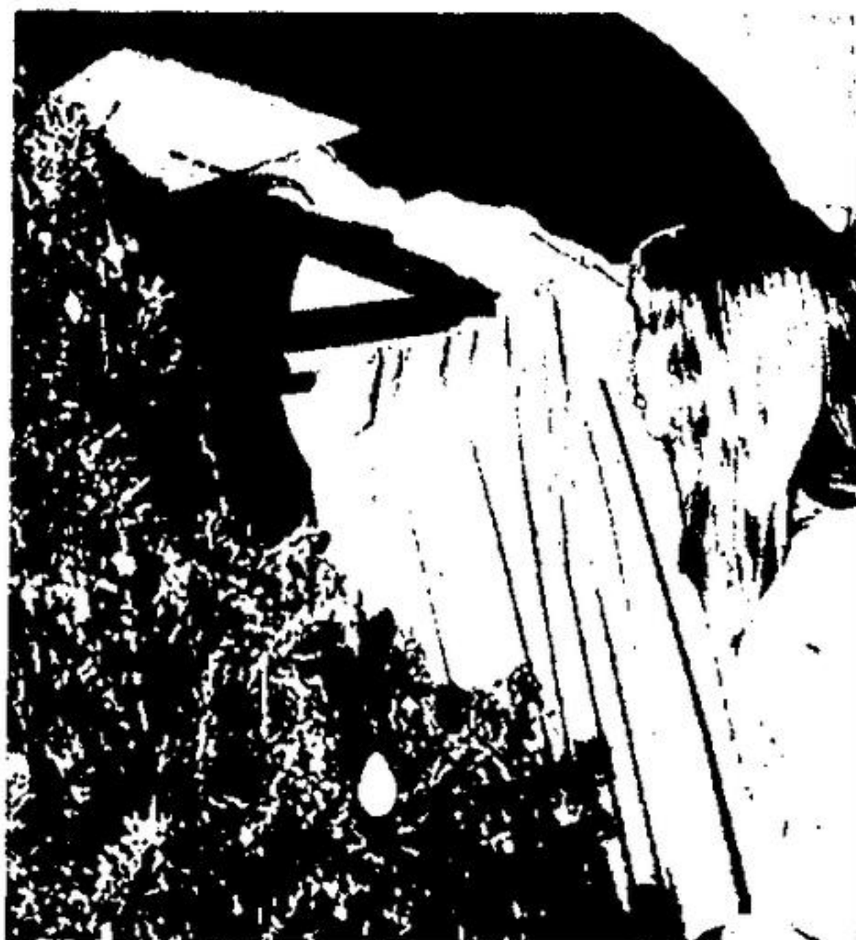
IT'S CHRISTMAS... and part of the holiday fun is found in the things children can do to help decorate the home for the Yuletide season. Whether painting windows or decorating the tree, it makes Christmas more meaningful when children participate.