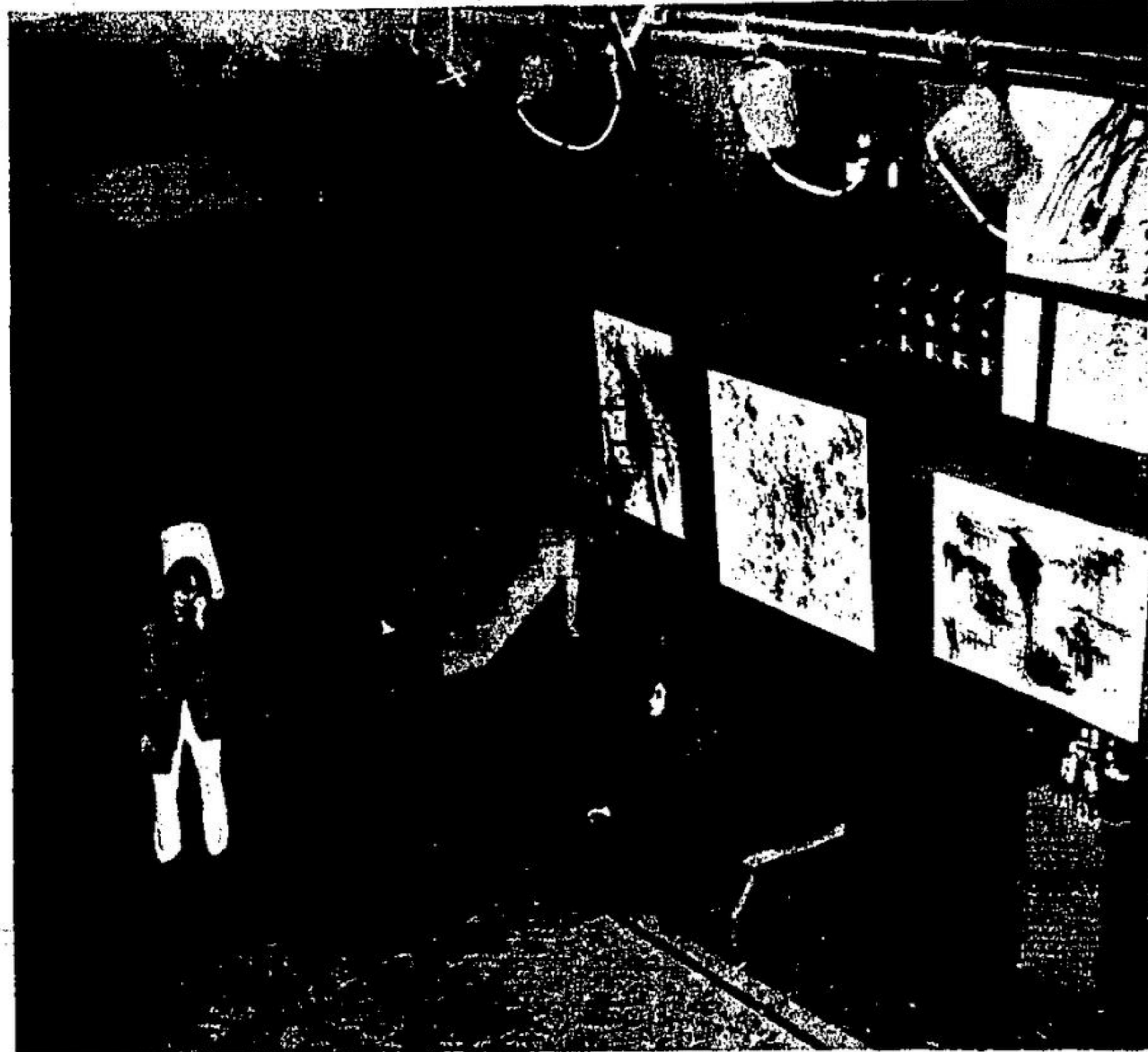
Georgetown high school Stage setting for scene in students' Black Comedy.