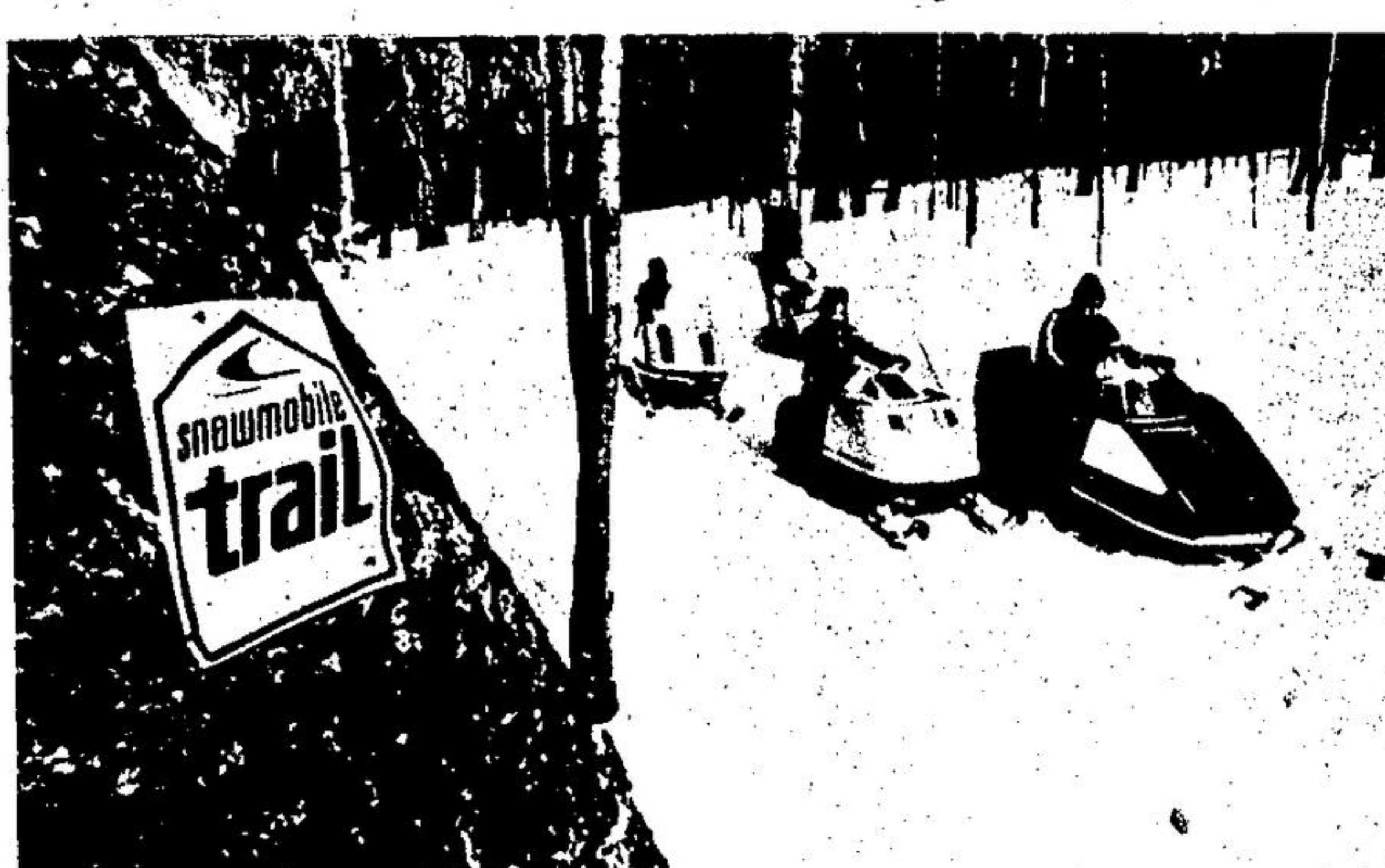
Thousands of acres, and miles of trails await snowmobilers.