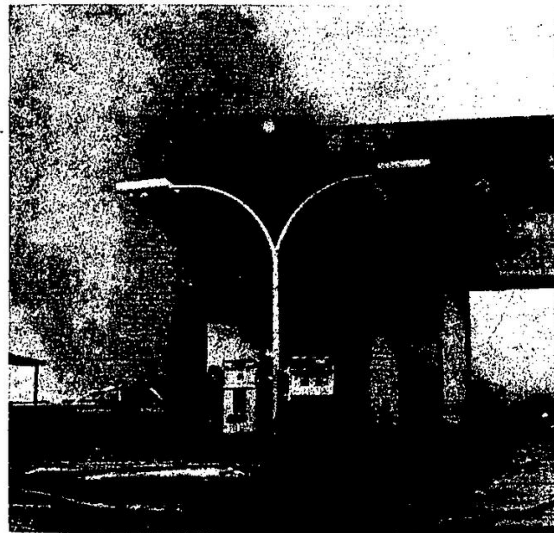
Little is left of garage razed in a fire at Norval Thursday.