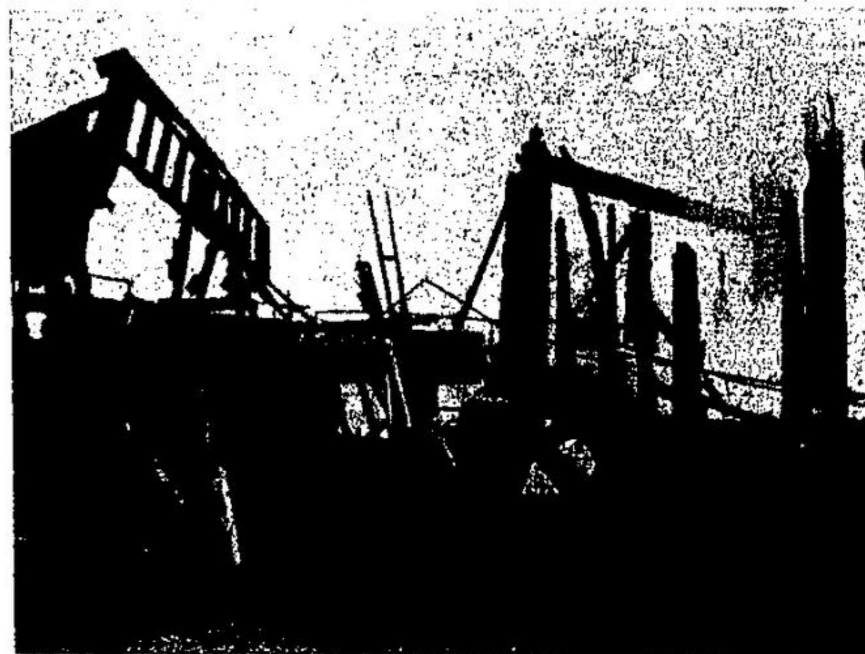
A front end loader knocks down charred spikes.