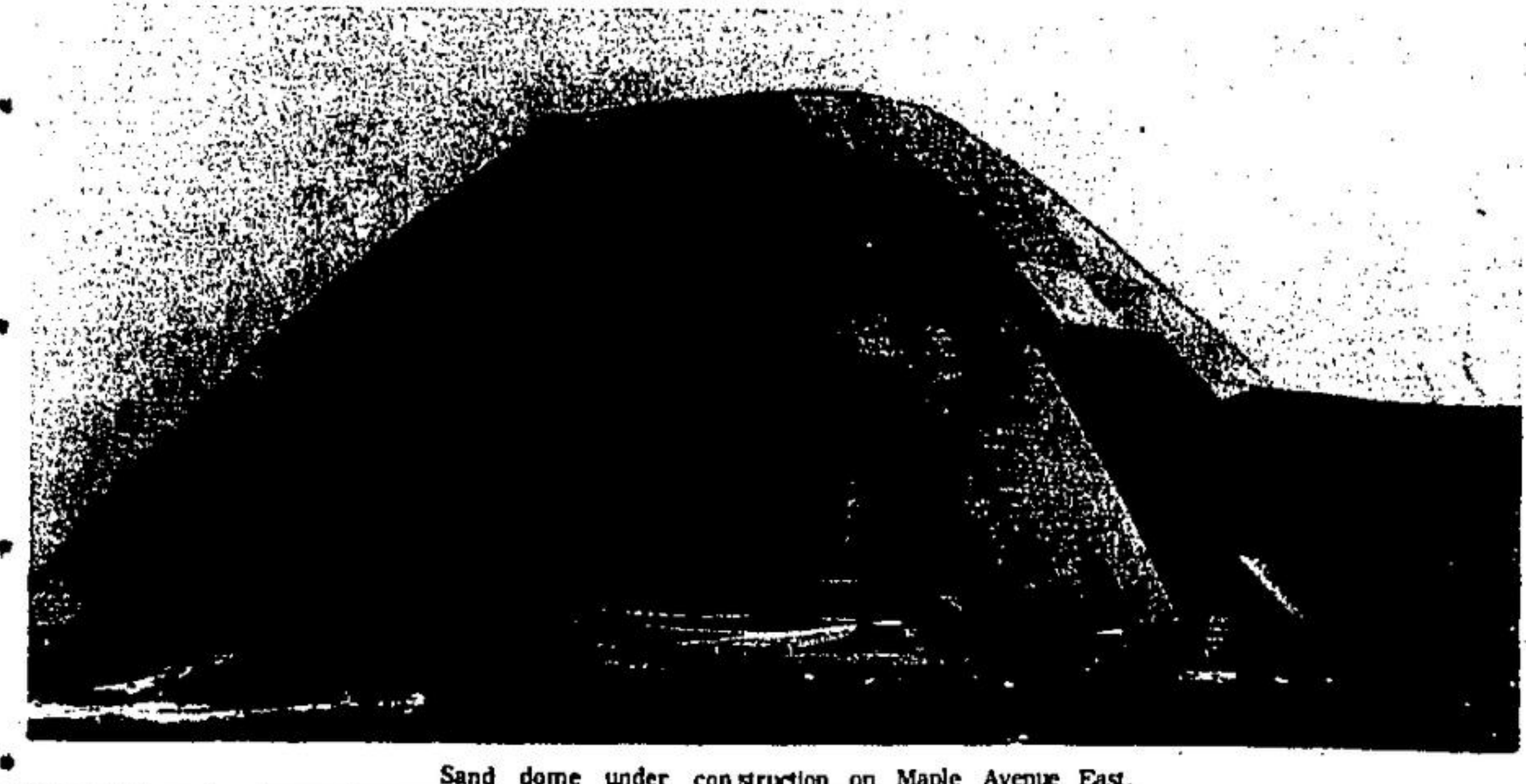
Sand dome under construction on Maple Avenue East.

NIGHT PATROL This year the town has a night patrol on duty from 9 p.m. till 5 a.m. Their duties include patrolling the roads, so any sanding or ploughing necessary will be done faster enabling the commuter to get to work easier. If this proves successful the town will consider three shifts, giving 24 hour protection