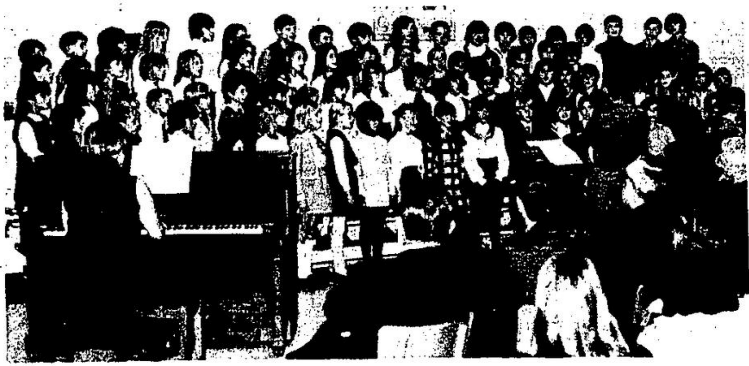
A childrens choir made up of pupils at St. Francis of Assisi Roman Catholic Separate School entertained at the school's blessing and official opening. The new open concept school is at the corner of Sinclair Avenue and Duncan Drive.