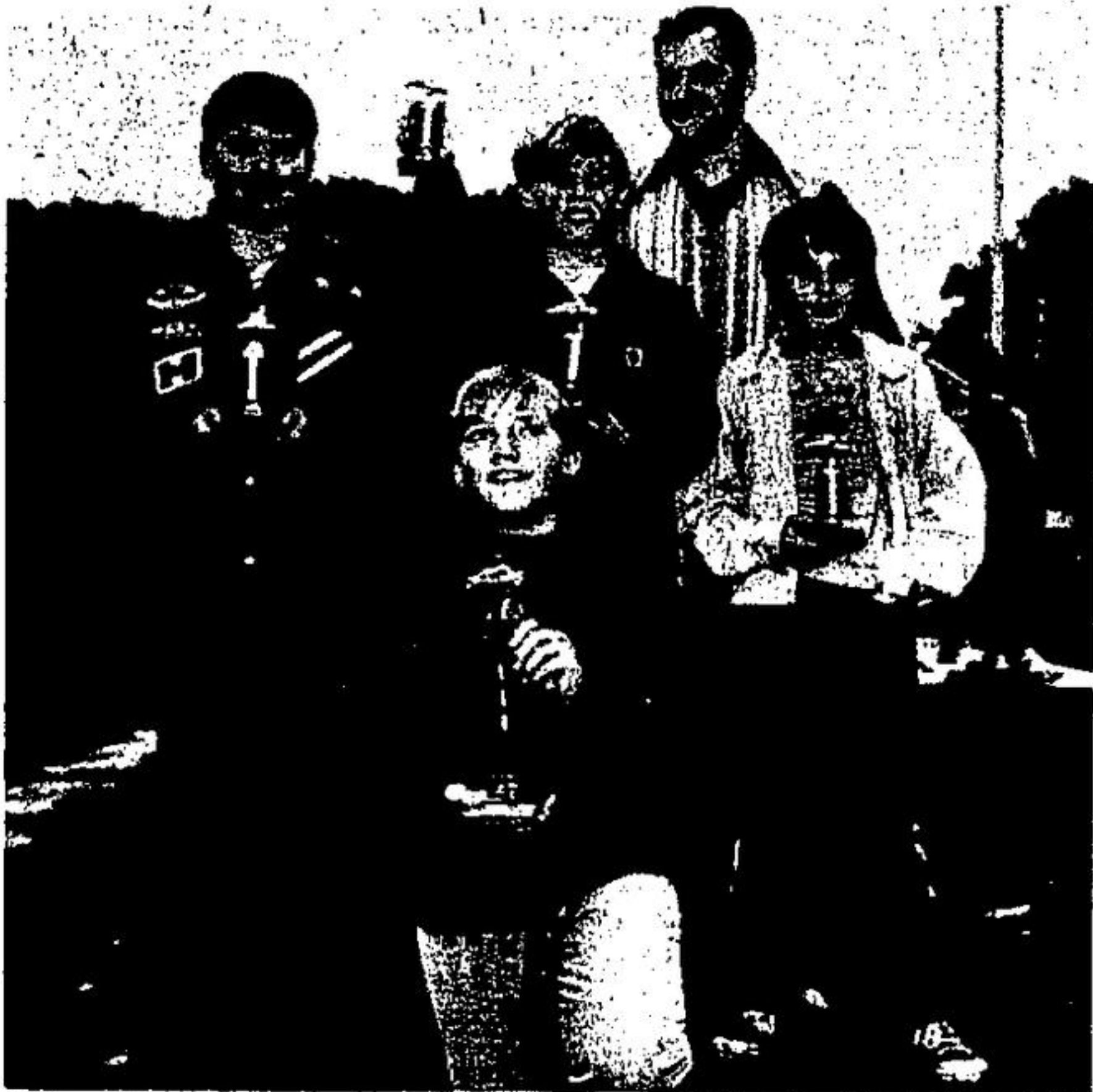
Senior drivers successful in their divisions at the recent Grand Prix races for soap box cars were, from left