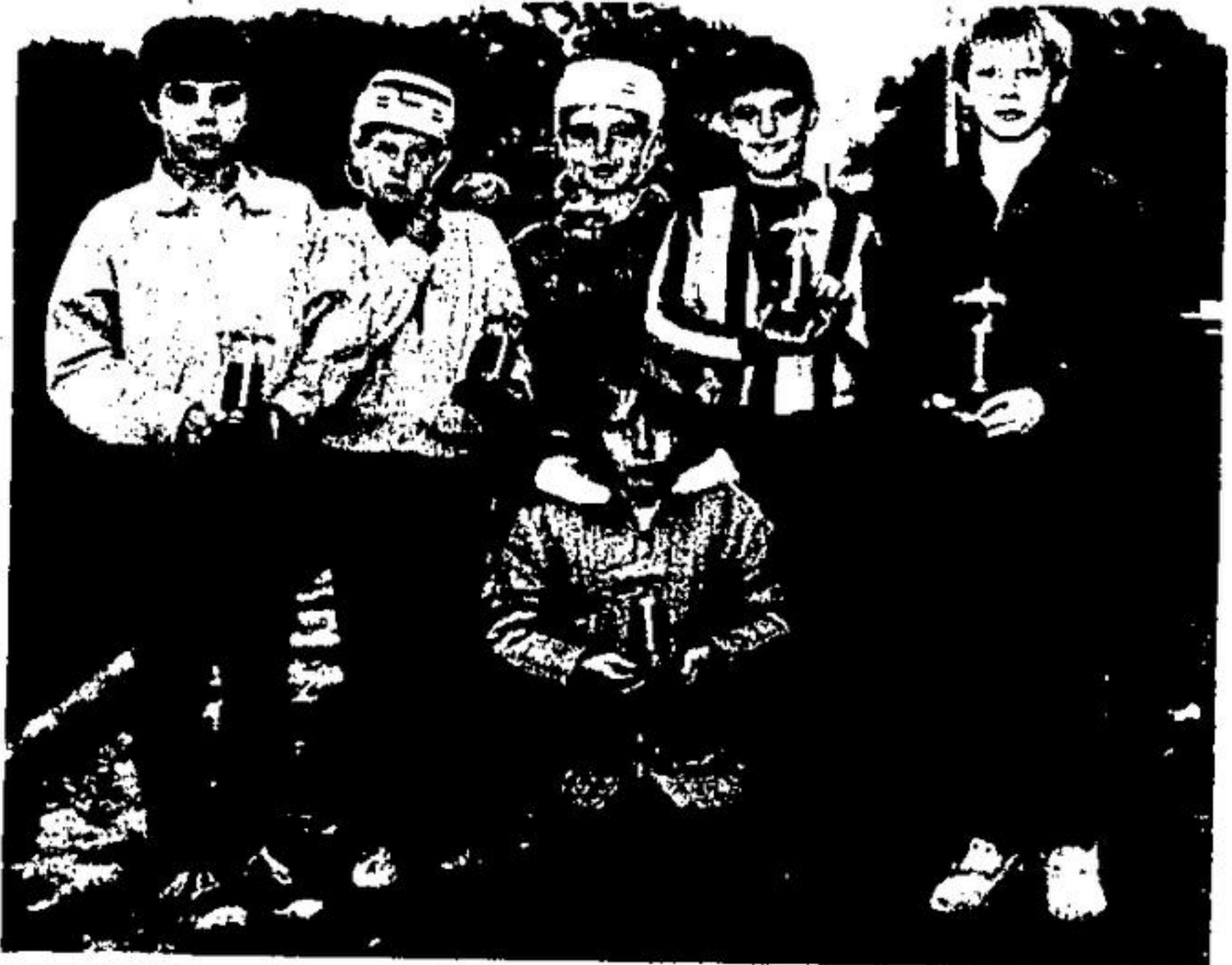
Junior division drivers were winners at the recent Grand Prix for soap box