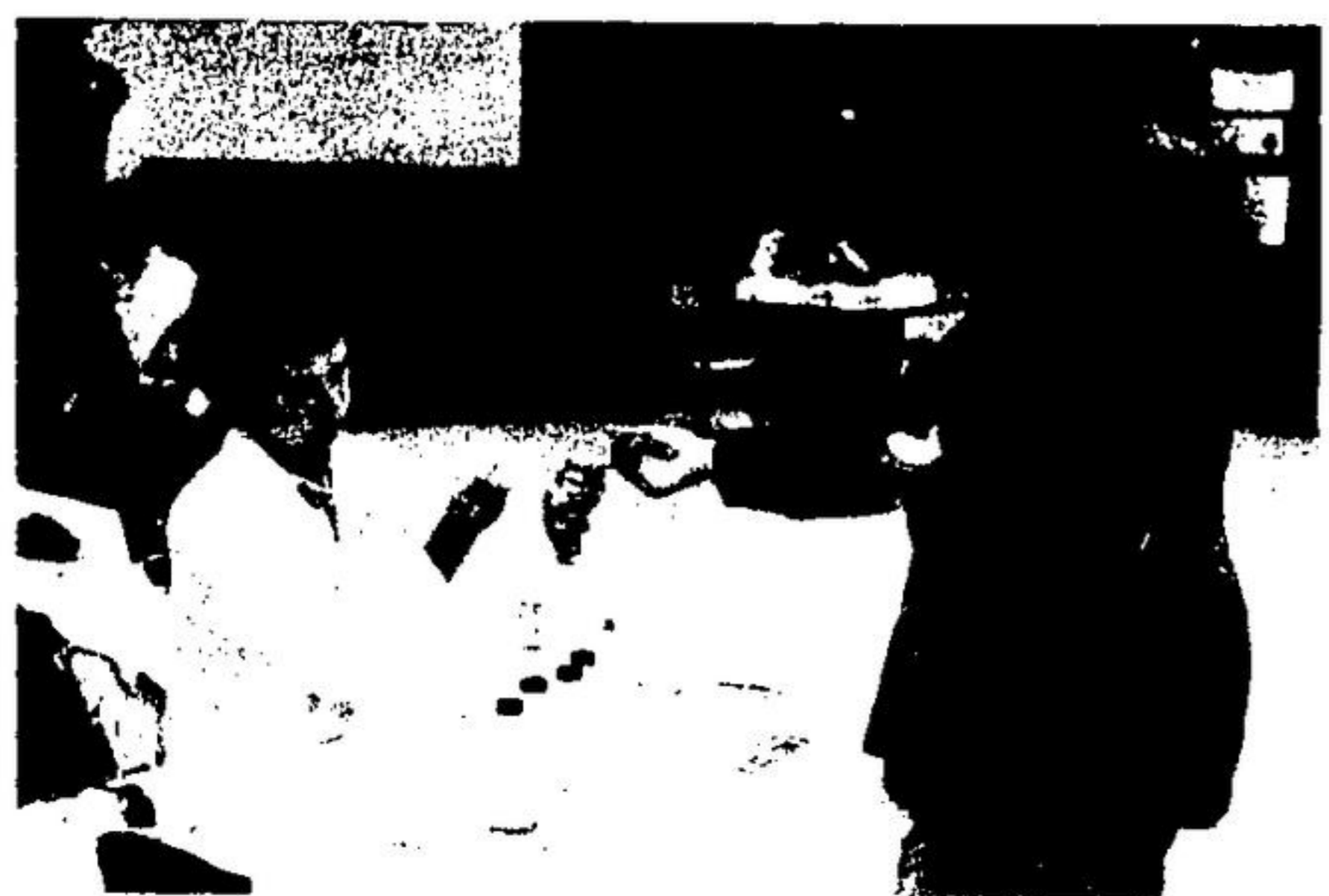
Taking blood sample for type test at the Georgetown Red Cross blood donor clinic in September.