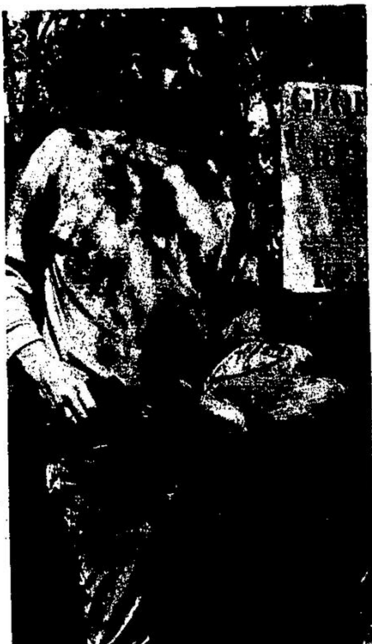
The turkey is frozen but not with fear. Modern day durkey shoots use regular