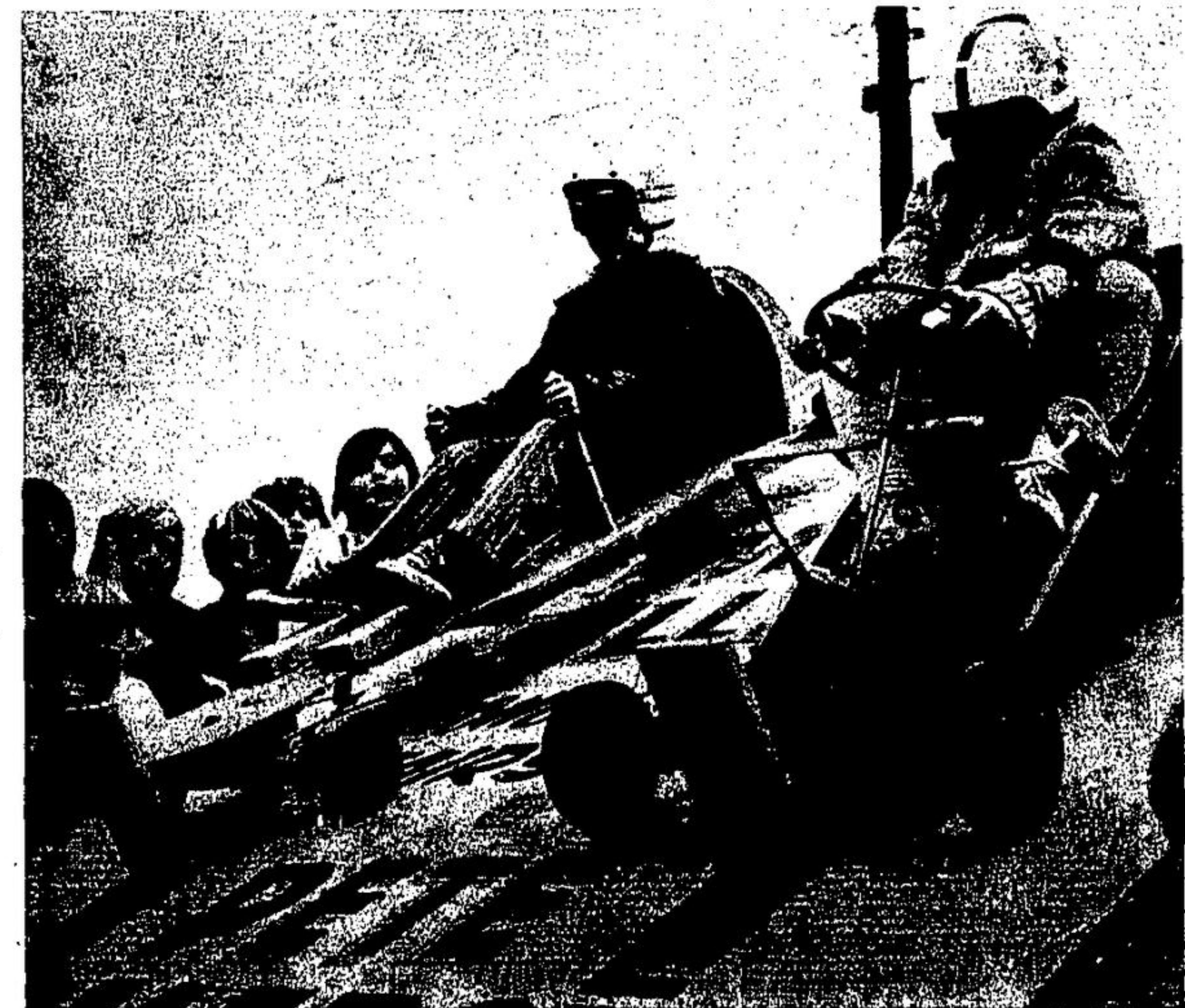
FIVE . . . FOUR . . . THREE . . . TWO . . . ONE

He reiterated that members should not be paid when they don't attend a meeting.