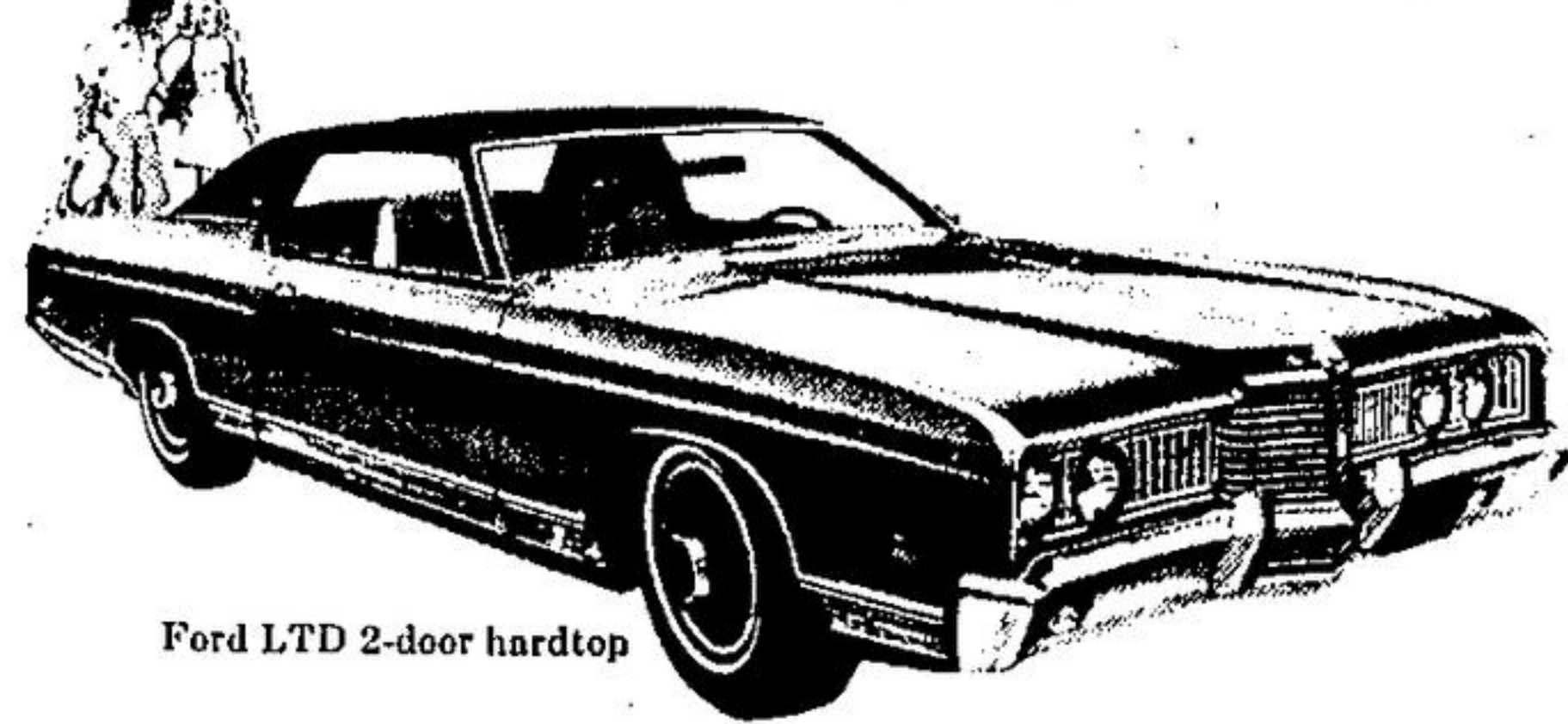
Ford LTD 2-door hardtop

Ford Galaxie - Custom Thunderbird - Ford Ltd. Mustang All New Torino Ford Trucks